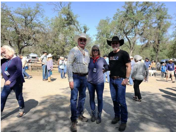
Cali Rally