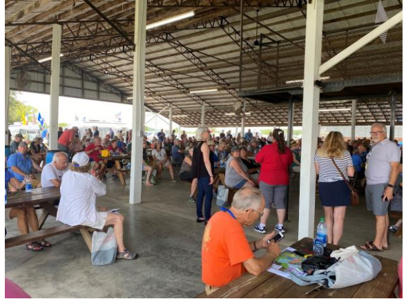
First Timers Information Session