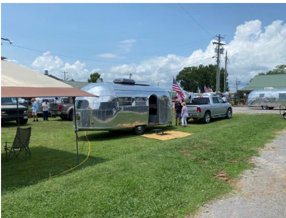
Very vintage, very nice!