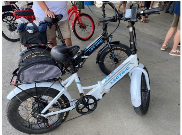
There were electric bikes...everywhere