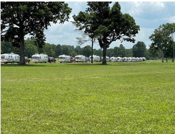
Like the checkout line at the supermarket when show is in the forecast