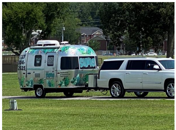
Artistic expression on two wheels