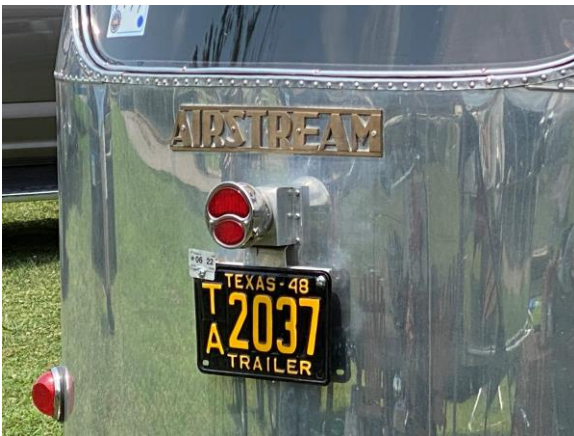
1948 Model Year