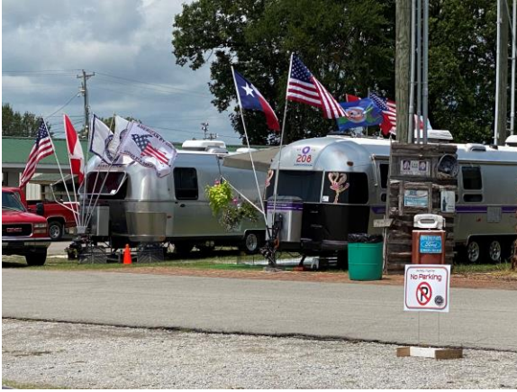
Proudly showing their flags