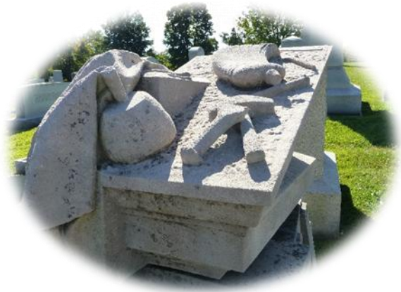
Limestone carvings on Cemetery markers