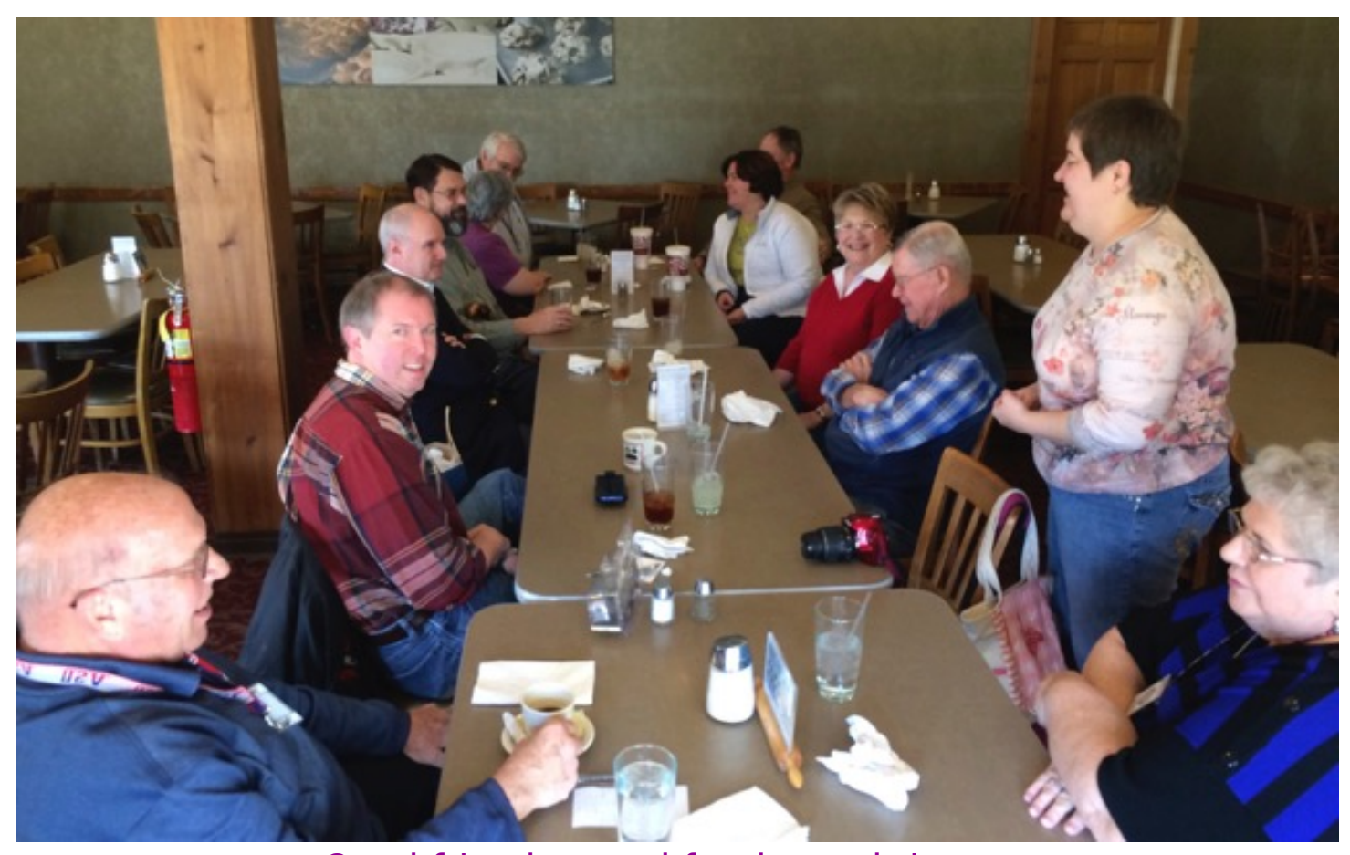
Good friends, good food, good times...