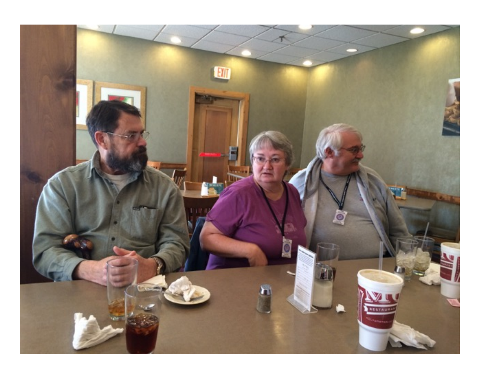
"Oh, my!" - Always the chance of a surprise at a luncheon!