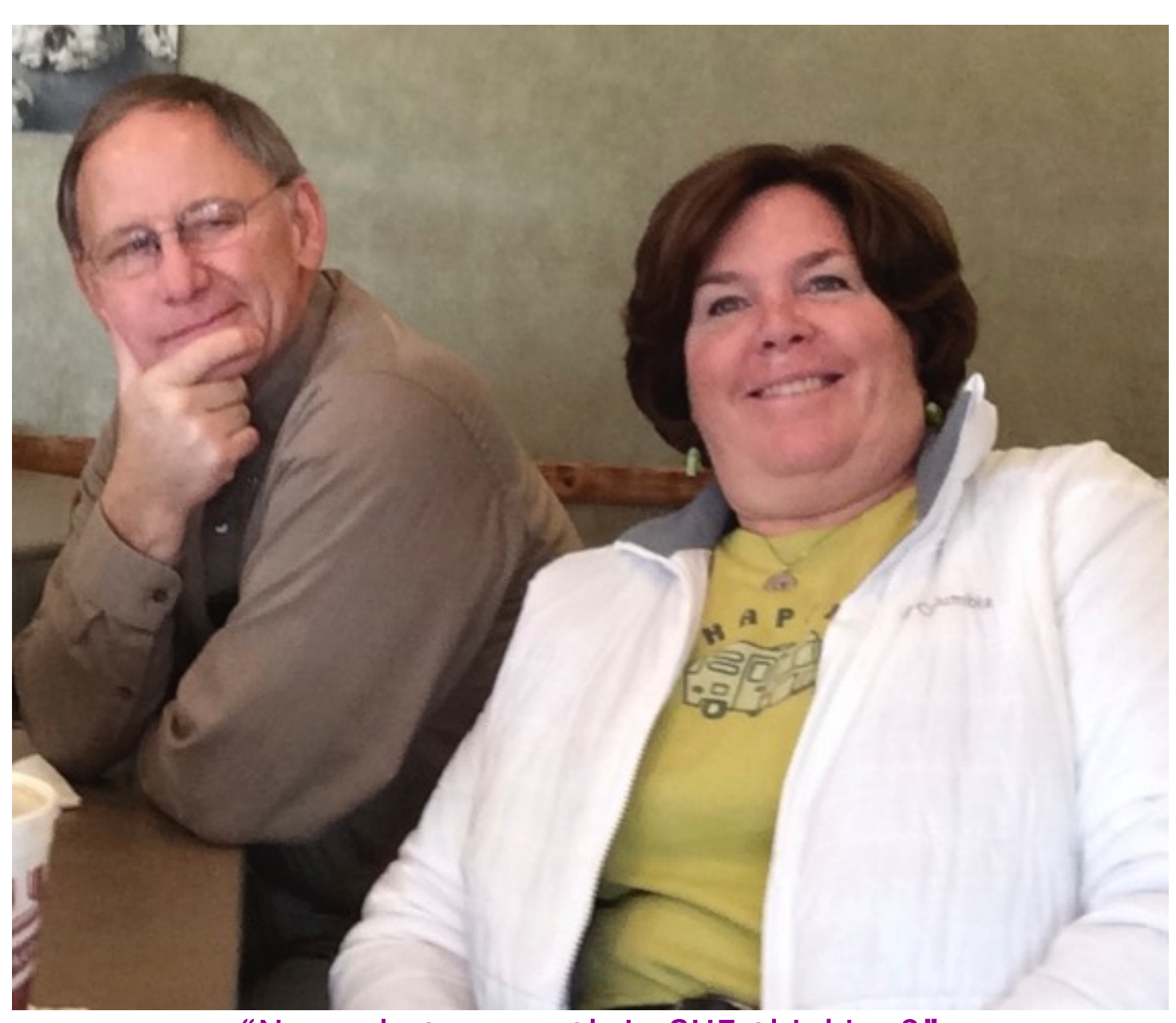
"Now what on earth is SHE thinking?"