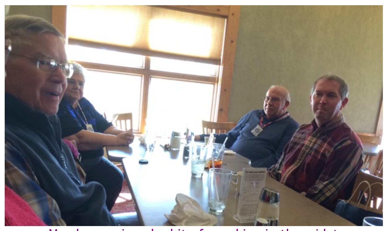
Members enjoyed a bit of sunshine in the midst of winter --- even if it did come through a window!