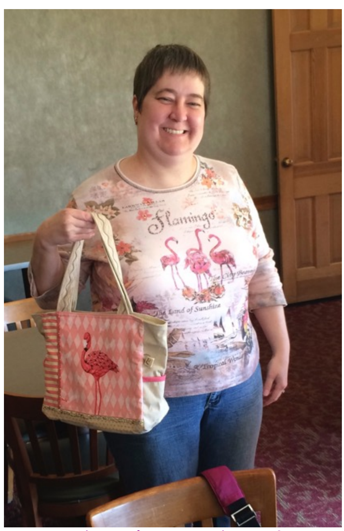
Is this Ken's January Flamingo?