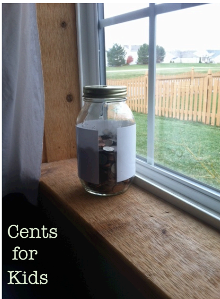
Cents for Kids