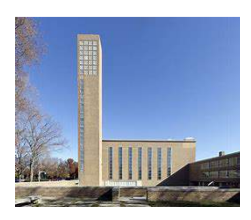
First Christian Church (1942) Architect: Eliel Saarinen One of the many architectural treasures of Columbus.

https://region5.airstreamclub.net/2020region-5-rally/