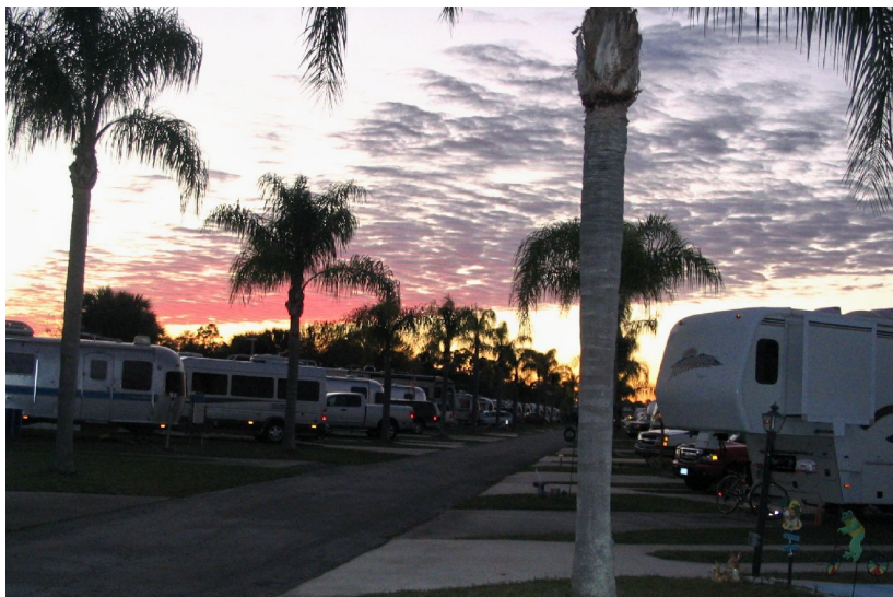
This picture has nothing to do with the rally, luncheon, etc.—I just like it.—This is the street where I spent Jan.Feb.March and some of April. It's in Land Yacht Harbor, Melbourne, FL.