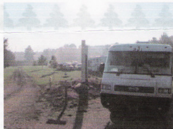
The caravan lined up to leave the overnight camp and heading for Sugar Creek .