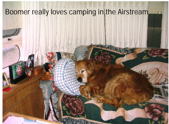
Boomer really loves camping in the Airstream