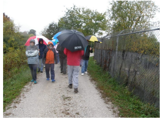
Our visit to Wolf Park had lots of umbrellas