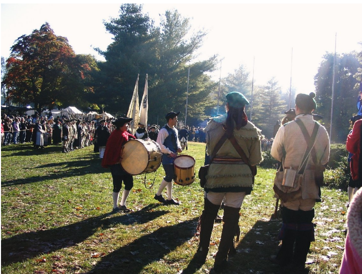
OPENING CEREMONIES AT THE FEAST OF THE HUNTER'S MOON