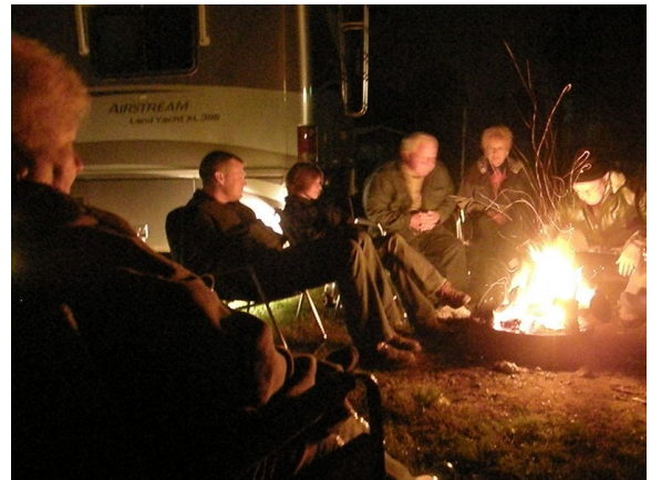
Saturday night the rain finally gave up and let us have a camp fire