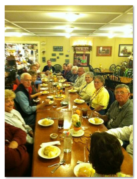
The Apple Dumpling Gang at McClure's Tate Orchard near Peru.