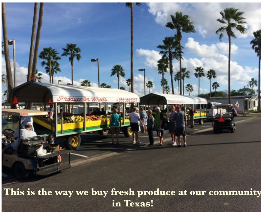
This is the way we buy fresh produce at our community in Texas!

I am in the Rio Grande Valley region of Texas, this is the area that grows a lot of fruit and vegetables for America. In Indiana we are accustomed to driving by 100 acre fields of corn or soybeans; here in the Valley we drive by 100 acre fields of onions, cabbage, broccoli and sugar cane, or it might be 500 acre grove of oranges, lots of fresh produce.