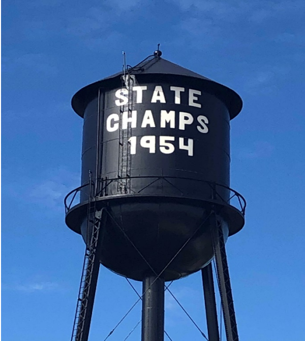
Water Tower, Milan, Indiana