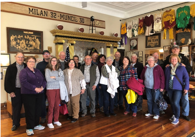
Our Group at the Milam 54 Museum

"No discussion of Indiana basketball would be complete without mention of the "Milan Miracle of 1954." On a cold March night in Butler Fieldhouse, the Indians of tiny Milan High School (enrollment 161) defeated the mighty Muncie Central Bearcats (enrollment 1,662) to win the state championship and secure their place in Hoosier Folklore