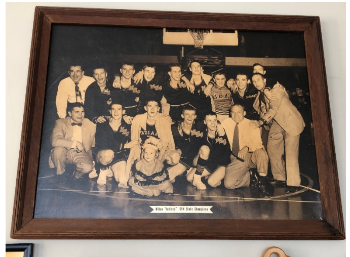
State Champs, 1954 Milan Indians