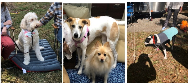
And of course, we had some 4-legged campers along with us for the weekend!