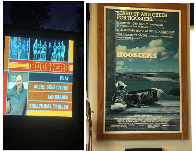
Saturday Night at the Movies