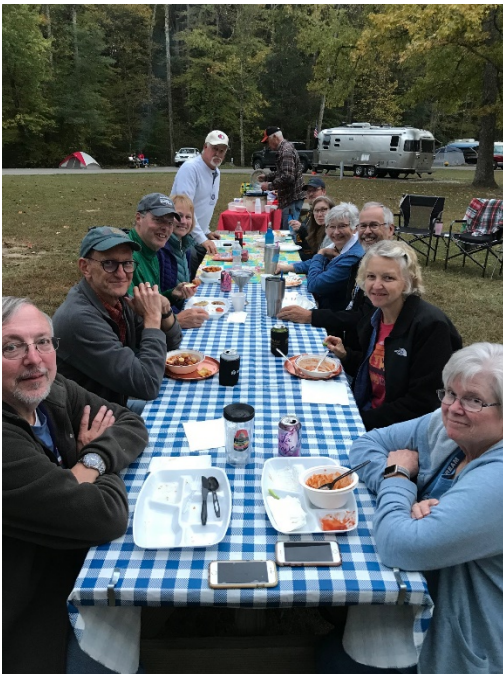
Pitch in Dinner