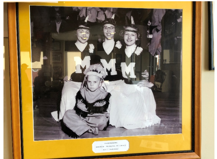
Indians Cheerleaders and Mascot