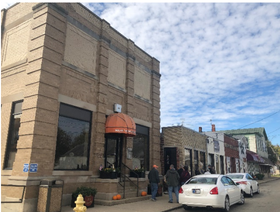
Milan 54 Museum