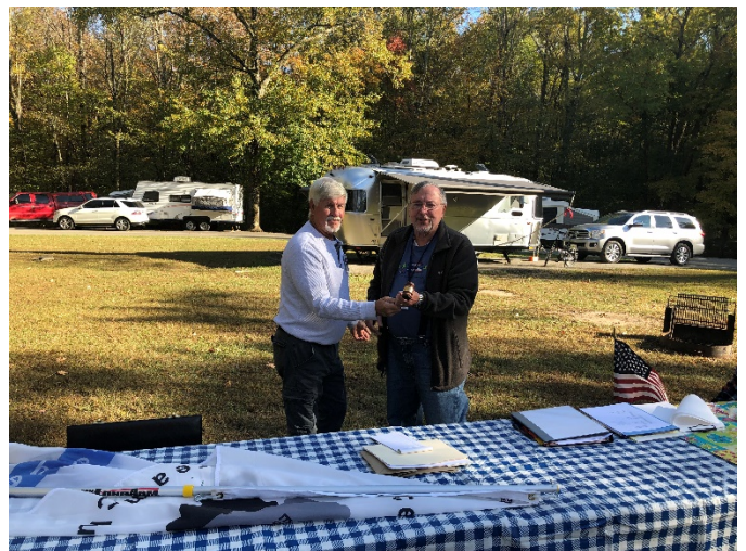
Passing of the Gavel