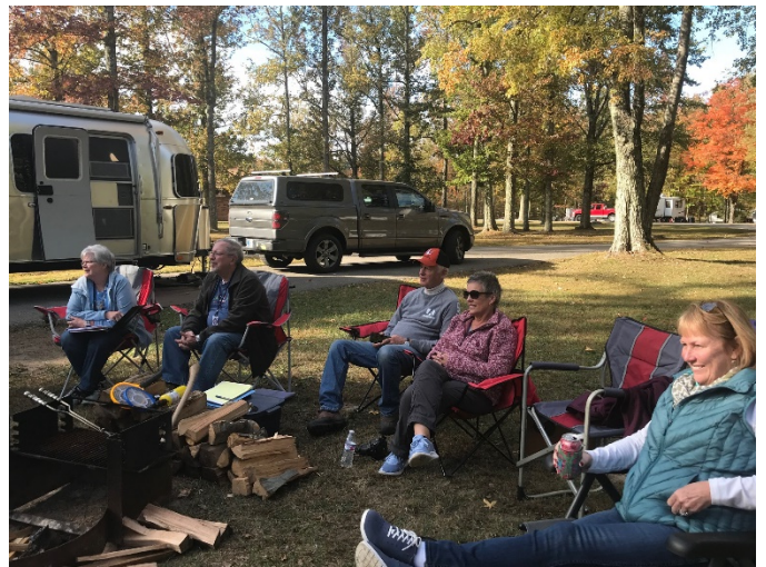
Visiting with Friends