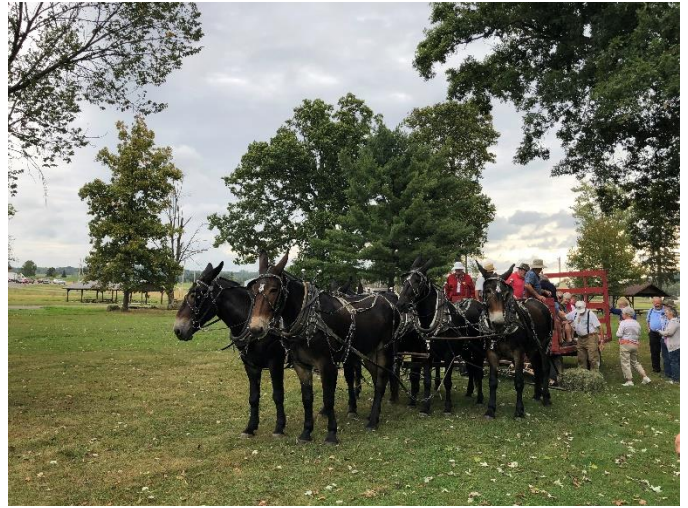
Six Mule Team

Where else can you see a 6-mule team pulling a wagon, or, go on a buggy ride with an Amish gentleman?