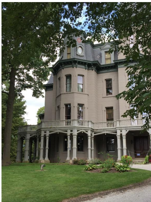
Historic Hegeler Carus Mansion