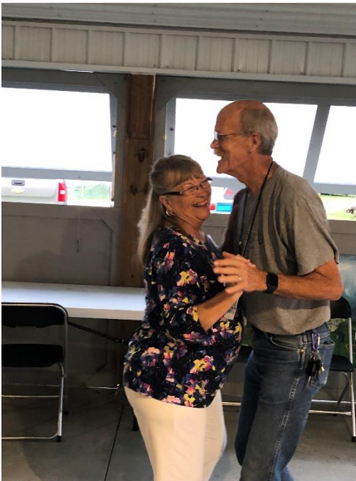
Look at this cute young couple!

There was nightly entertainment and some folks even danced.