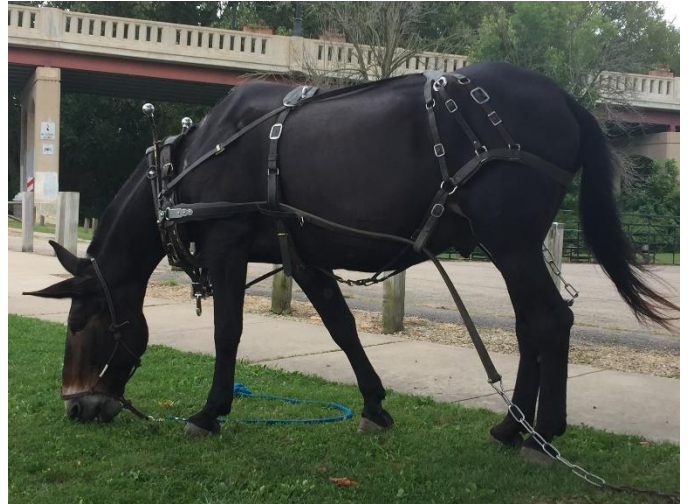
The Canal Boat is one horsepower, supplied by Larry