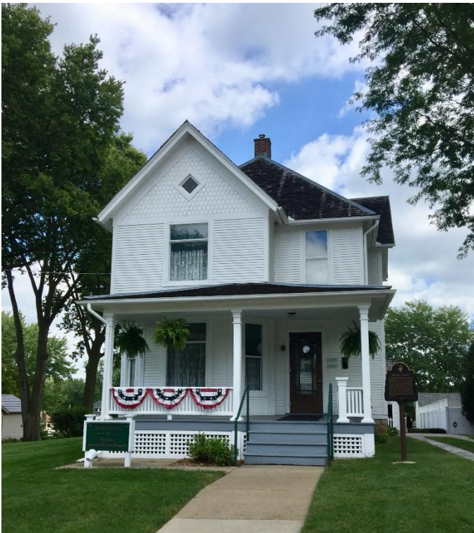
Ronald Reagan Boyhood Home