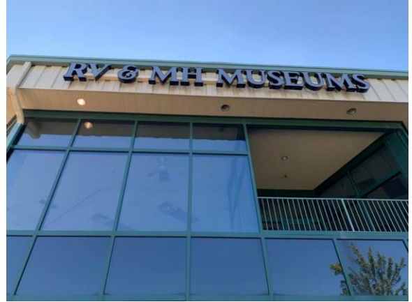
RV Hall of Fame