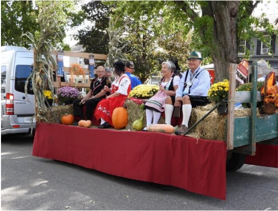
Rally float in the Ohio Swiss Festival Parade