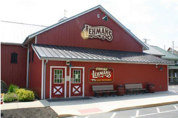
A trip to Ohio's Amish country is not complete without a visit to Lehman's Hardware in Kidron, Ohio