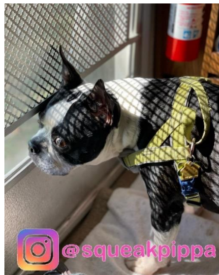
Tyson on guard, inside the Beal's Airstream!