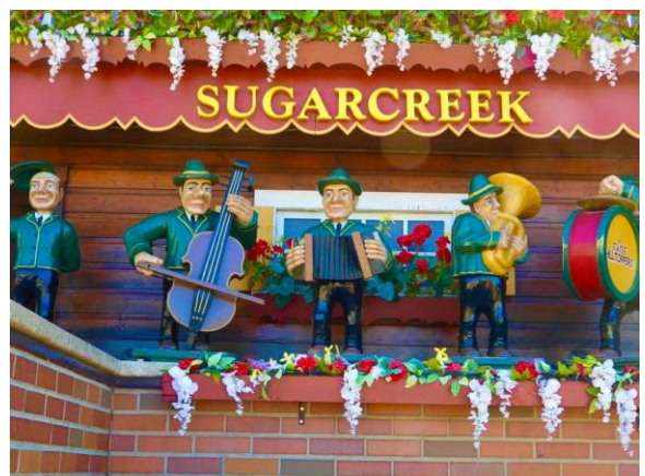
Amazing detail on the cuckoo clock