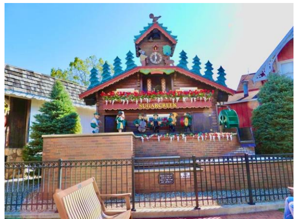
Cuckoo Clock, downtown Sugar Creek