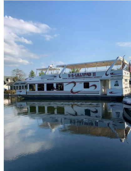
Dinner on the SS Lillypad