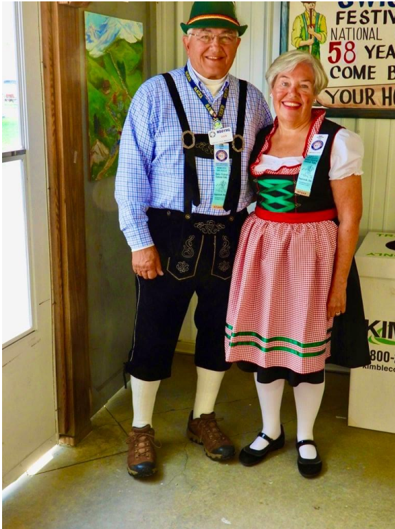
Many of the rally workers dress in traditional Swiss apparel