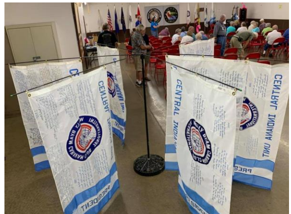
Central Indiana Club Flags