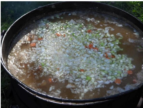
A highlight is a ham and bean supper. The meal is cooked in giant iron kettles over a wood fire