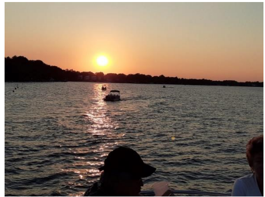
Lake Wawasee Sunset