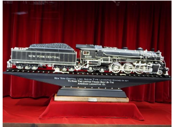
Ernest Warther Museum, Dover, Ohio Wood Carving Collection