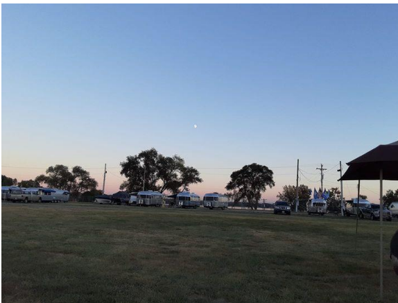
Sunset at the Campground