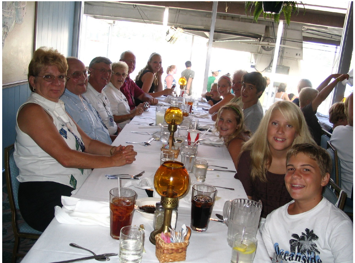
One table of the group at Saturday night dinner at Indiana Beach