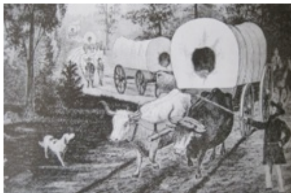
1764 18' NB Daniel Boone Model Complete with Rustic Interior and Oxen Tow Package

including two Antique Alley tours, a Chocolate Trail, historic Richmond Depot District, Indiana Football Hall of Fame, Model T Museum, Tiffany Stained Glass Windows Tour, historic Centerville, plus many opportunities for hiking, biking, and geocaching.