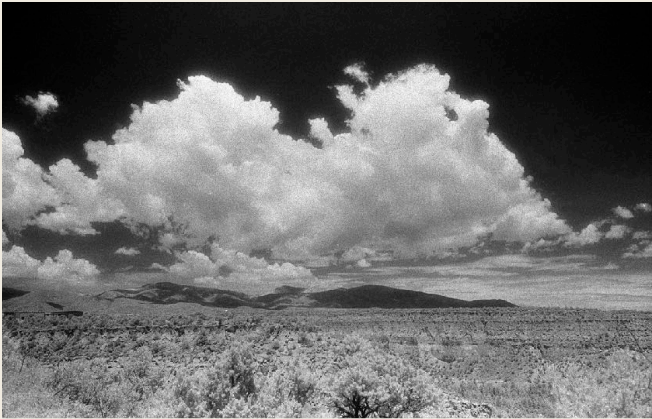
Clouds are Good