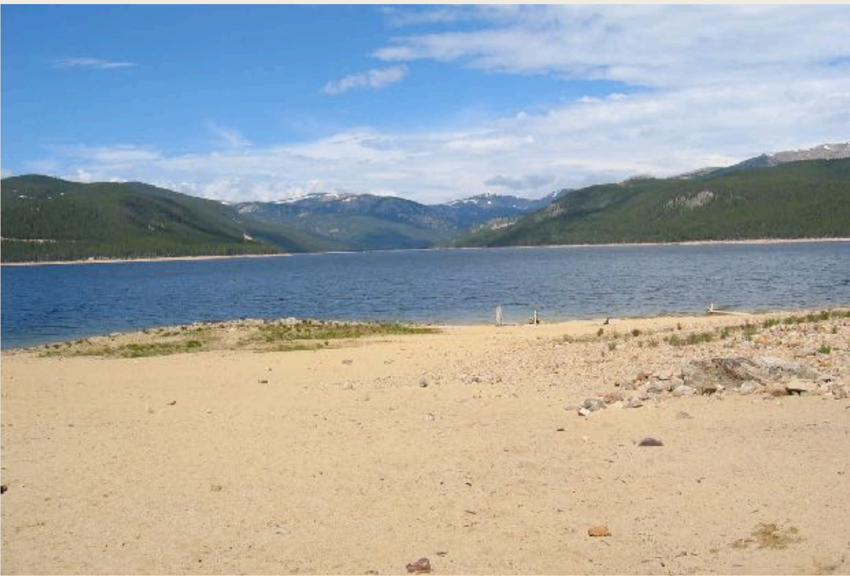
Weather is a photographer's secret friend A cloudless day is NOT good