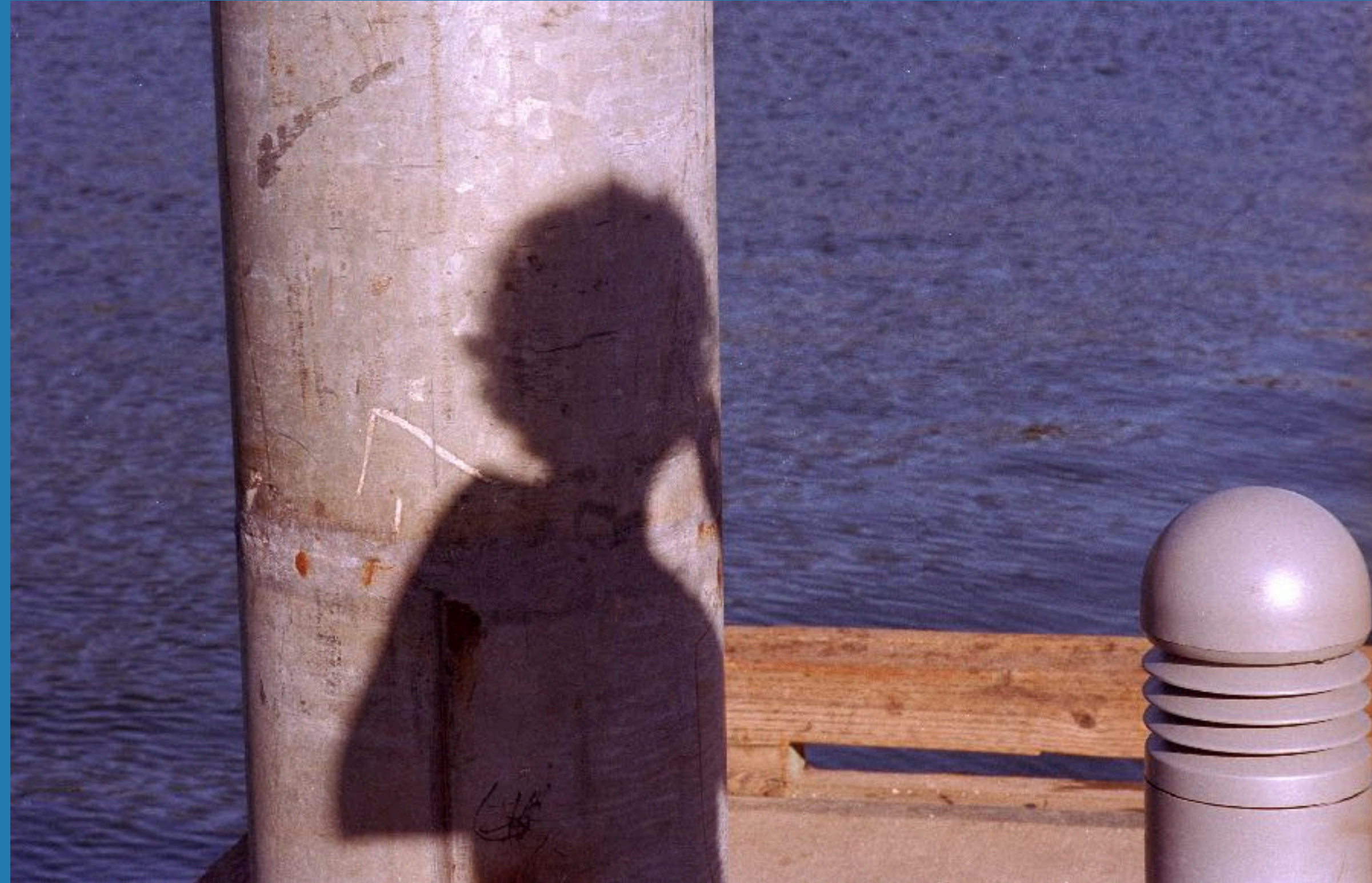
Interesting perspective of Obnoxious Lady on Phone