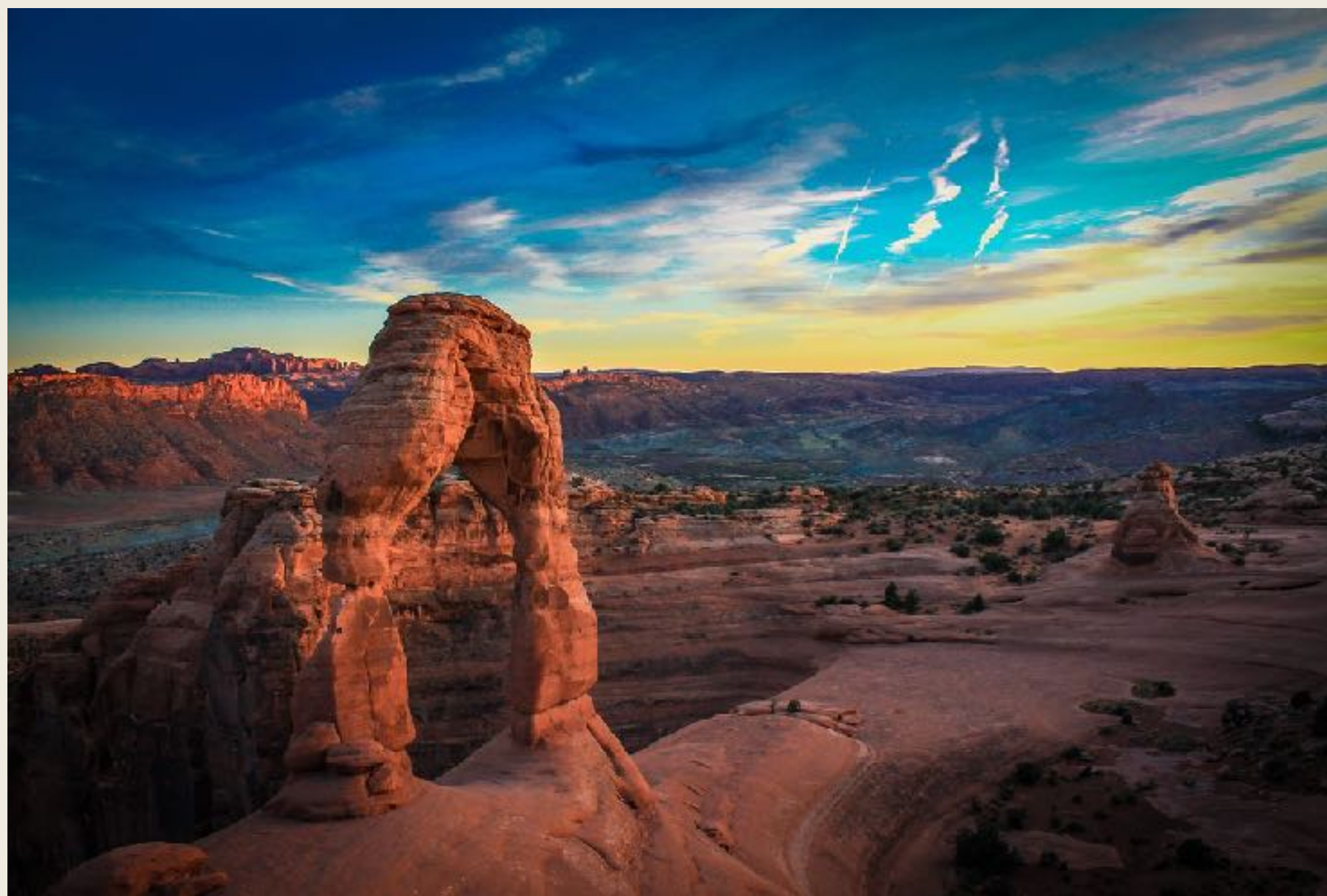
Delicate Arch, MOAB