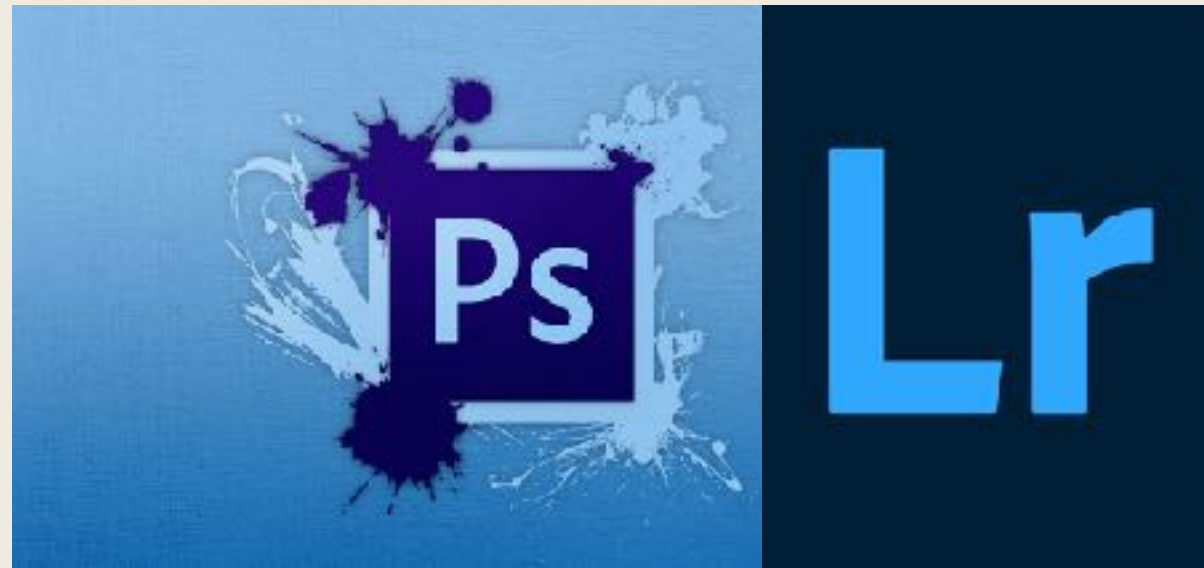
Image Manipulation and Cataloging Software

Adobe Photoshop and Lightroom Subscription Only - Monthly Charge