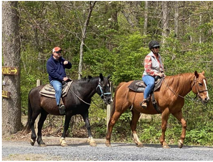
The Carters on the Trail