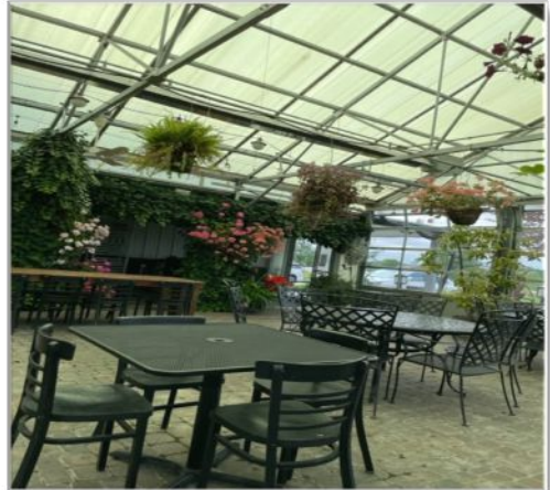
Van Till Family Farm Winery dining room showing beautiful flowers and hanging plants