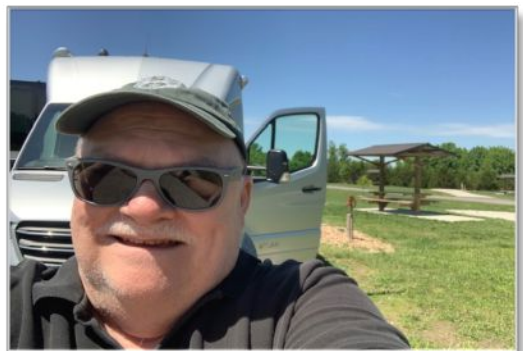
Me in front of Buttercup practicing our New Millennial selfie at Lakeside RV Park, Lawson, MO, No grounded electrical pedestals