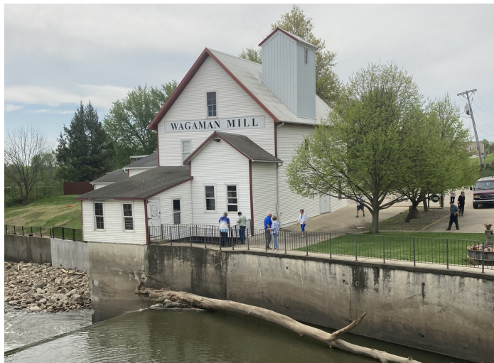
N. Skunk River. The mill not only ground grain for the farmers in the area, but it also generated sufficient elec-

After leaving the Wagon Wheel Tree, the caravan journeyed on to Lynnvile, where some time was spent at the Wagaman Mill, a water-powered mill built in 1848 on the