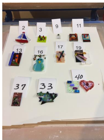
Monday, Kiln # 1