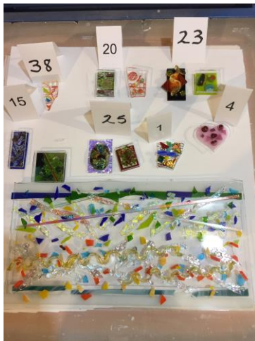
Tuesday and Wednesday, Kiln #2