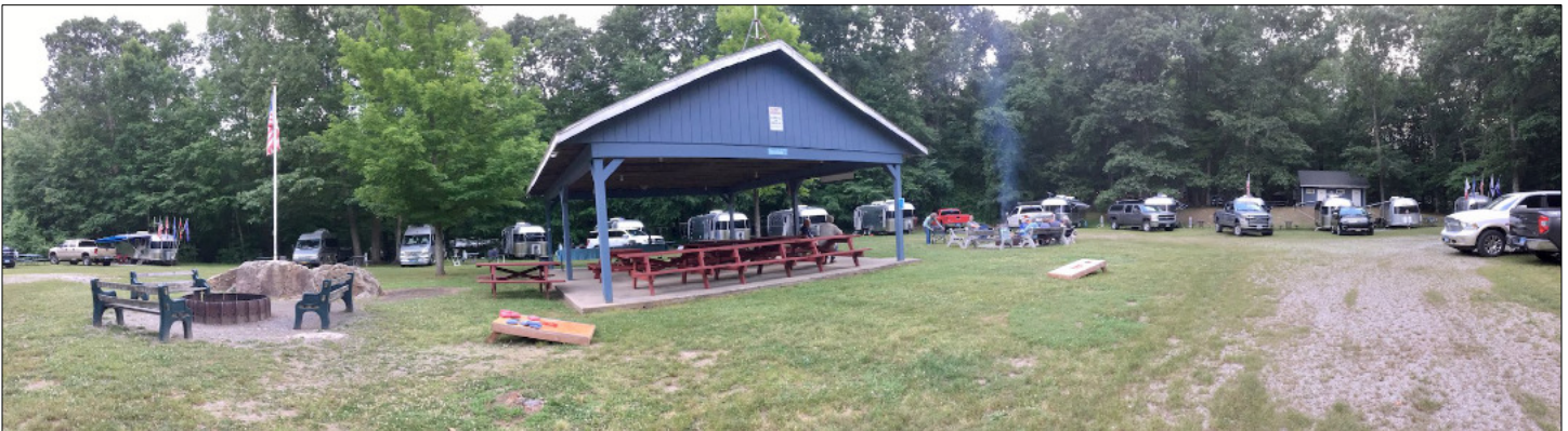
Great turn out at Water's Edge Campground.