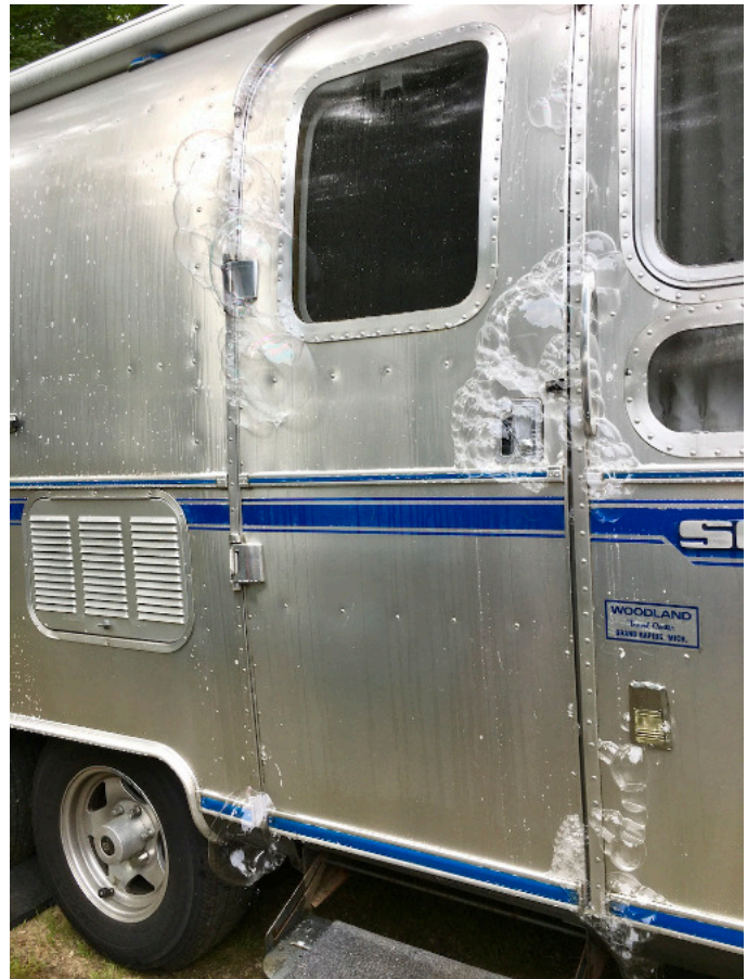
Time to install a new door gasket!