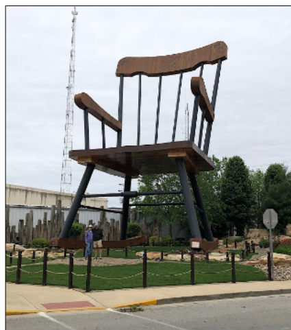
On the Old National Road in Casey, Illinois stands the world's largest rocking chair, bell chimes, comb, golf tee, barber pole, etc., etc.