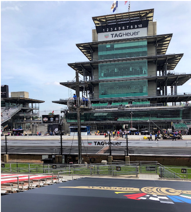
Indianapolis Motor Speedway claims to be the largest one day sporting event in the world, over 400,000 in attendance on race day.