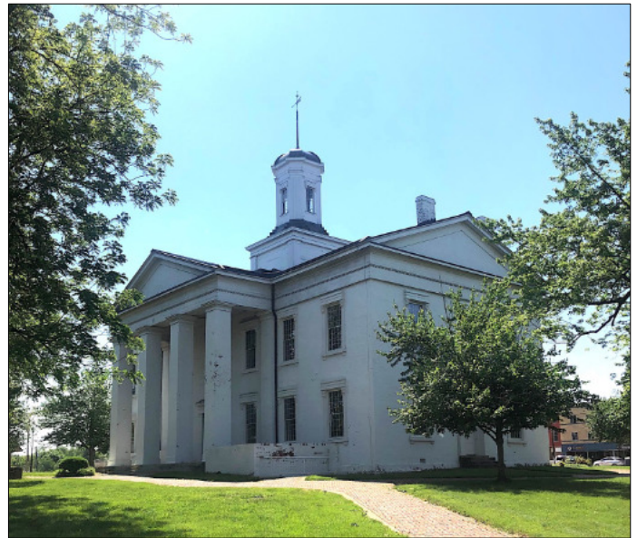
The old state house in Vandalia, Illinois, before the capital was moved to Springfield. The townspeople built this in less than a year's time in an attempt to keep the capital in Vandalia. Abraham Lincoln served as a representative from his district in this building and was part of the group that voted to move the capital. Our guide told us the townspeople did not support him in his bid for the presidency because of that.