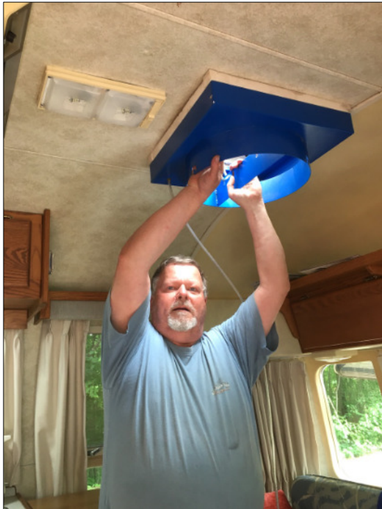
Russ's "Seal Tech" machine being attach to vent opening.