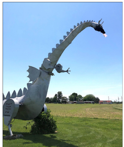
The dragon in Vandalia. Stop in the hardware store, get a token, put it in the drop box and the dragon breathes fire. The hardware store found another use for it's propane filling station.

Thank you Dick and Kit for sharing your adventure!