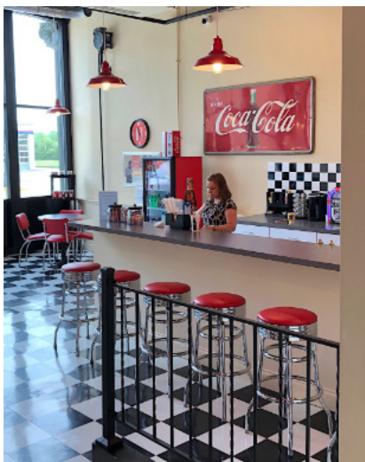
Vigo County Historical Museum in Terre Haute, IN where the iconic coke bottle came from. It was inspired by the curves and grooves of the gourd-shaped cocoa bean, not easily copied. The Coca-Cola Company wanted a shape that would not be confused with copycat brands