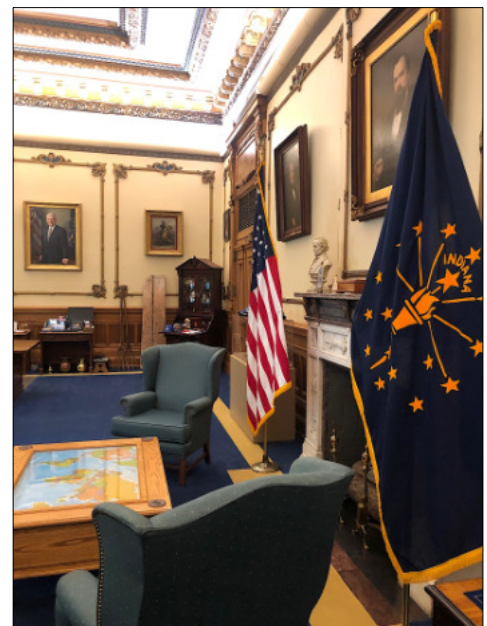
The governor's office in the Indiana statehouse in Indianapolis. All four branches of government under one roof in this huge building.