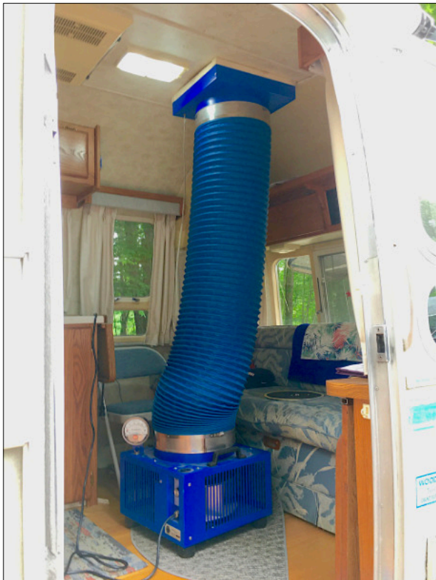
Attached and ready to be powered up!