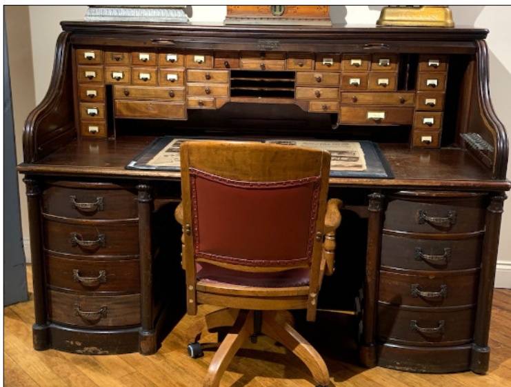
Just think of all of the things you could loose in those drawers. The desk was in the Vigo County Historical Museum in Terre Haute, IN, where they highlighted items made in that area. At one time Terre Haute was considered the "Crossroads of America" along the National Road.