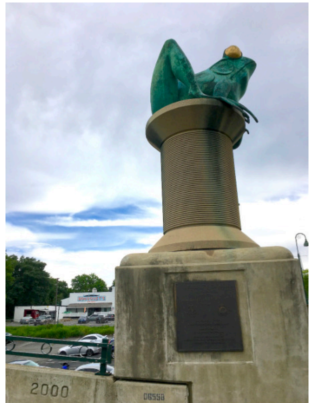
The town legend of their frogs is immortalized by cast bronze frogs sitting on a spool of thread adorning the local bridge abutments over the Willimantic River. Evidentially the legend goes back to the outbreak of the French and Indian War. The story has it that one night the towns people were all awoken by a loud commotion and a perceived attack on the town by the Native Americans leading mass hysteria and the towns people taking up arms. The commotion was later found to have been loud croaking and mass die off of mating bull frogs in a local pond.