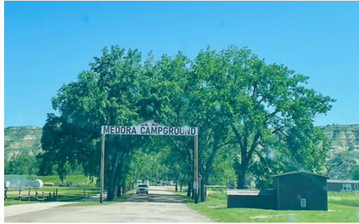
Entrance to Medora Campground

We arrived at our campground on Thursday, June 23, 2022 to set up our campsite and get ready to greet our campers. Weather can always be a challenge from very hot to cooler weather, very windy to calm, but we all can say we enjoyed our time together.