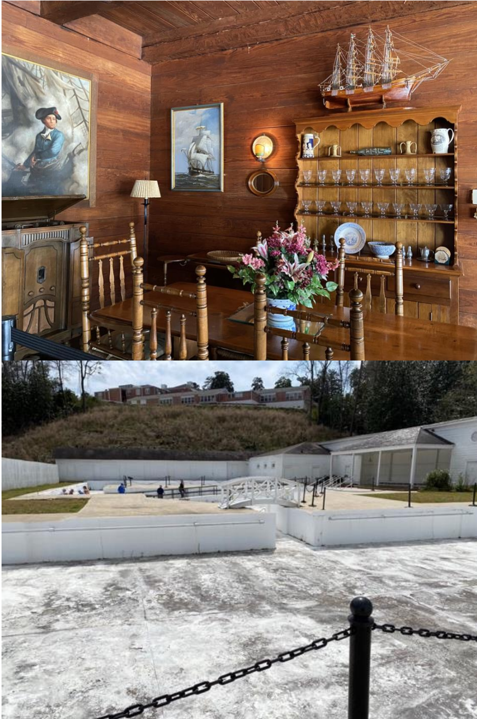
March 24, 2022 – Caravan Day 24 – Last Night of the Caravan, Final Banquet at Carriage & Horses Restaurant, Pine Mountain