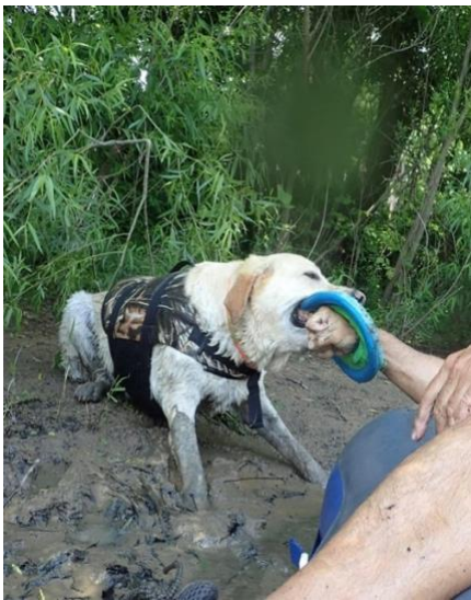
Seneca is sorry not sorry!