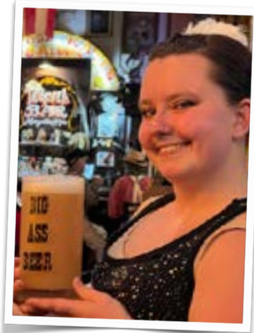
One of the saloon girls at Big Nose Kate's where we enjoyed dinner and beers on Thursday

If you've never been to Tombstone, you really should go. And staying at the Wells Fargo RV park made exploring really easy since it's just a short walk to all the fun!