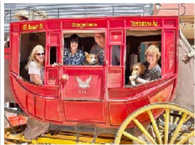
You can't go to Tombstone and not go on a stage coach ride!