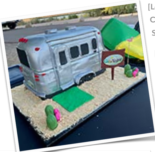
[Left] an Airstream Cake donated by the Safford Chamber.