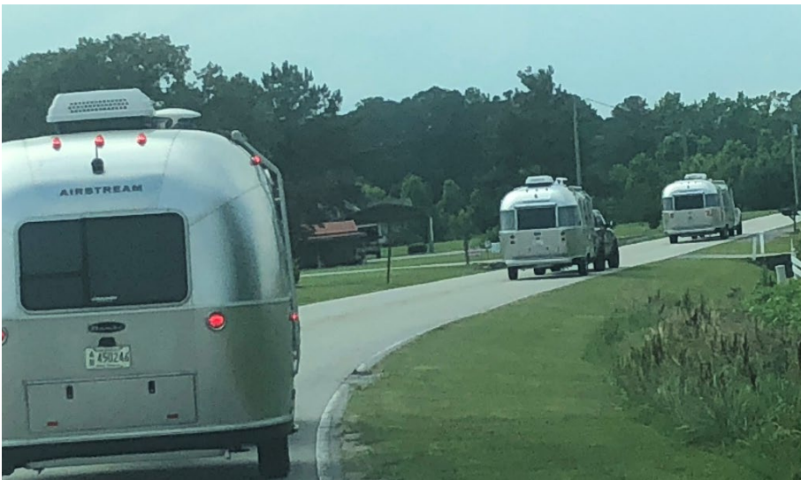
Above: A small group of Arkansas Airstreamers leaving Ocracoke, North Carolina; below: sunset on the Bourbon Trail Caravan