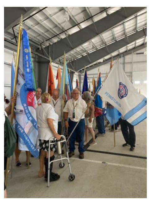
Visit <a href="https://photos.app.goo.gl/bAm5LnFjxbptCX63A">https://photos.app.goo.gl/bAm5LnFjxbptCX63A</a>