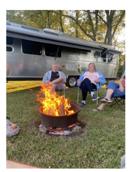
Visit <a href="https://photos.app.goo.gl/bAm5LnFjxbptCX63A">https://photos.app.goo.gl/bAm5LnFjxbptCX63A</a>