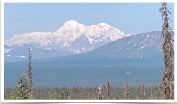
Mount Denali at 20,300 feet

We found the Canadian part of TOWH was great, the US side, not so good. It was a relief to finally make it to Tok where we rejoined the Alcan Highway and started our loop through Fairbanks to Denali National Park. Denali was one of our most anticipated stops. Here we jumped on the 9:00 a.m. shuttle with high hopes of seeing the mountain and lots of wildlife. We were pretty much skunked on both. We saw caribou but no grizzly bears, wolves, sheep or moose. The biggest disappointment was that at the end of last season they had a major road slide so the shuttle could go no farther than Mile 43. All the wildlife must be enjoying the peace and quiet past Mile 43! We definitely felt as though we had not thoroughly explored Denali and hope to return someday. We packed up early in the morning to continue our journey and low and behold we saw the very top of Denali! It was way off on the distance but it was there and as we headed towards Talkeetna the clouds cleared and we had a fantastic view of Denali!