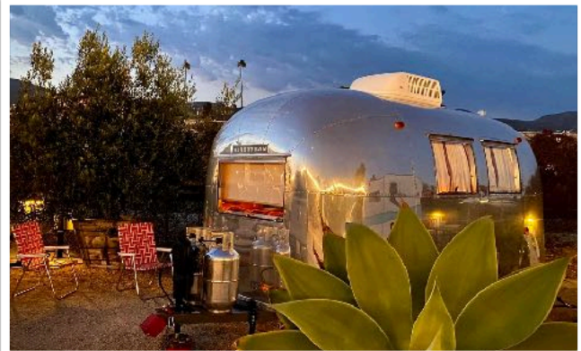
Barretts in Ventura