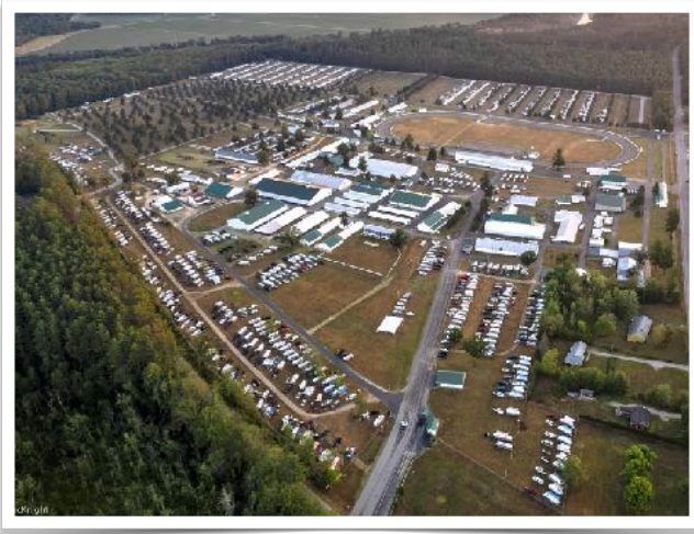
Fryeburg Fairgrounds with 935 Airstreams