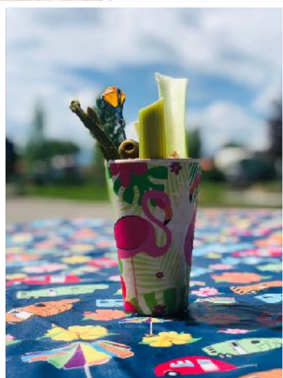
Gregg in CO and a summer feast in a cup