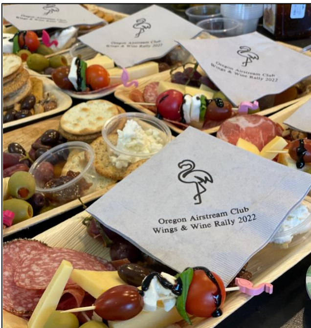
Wings and wine...well, wings and vine