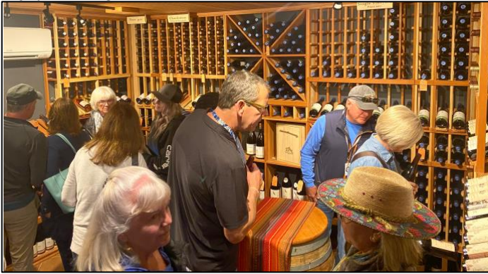
Exploring the wine shop at The Eyrie Vineyards ...so many amazing wines and vintages to choose from.

On Saturday, we had the opportunity to visit Durant at Red Ridge Farms , where we explored the grounds, visited the gift shop and plant nursery, tasted olive oils and vinegars, and enjoyed a flight of wine.