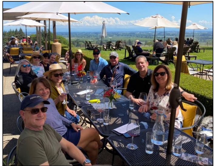
A perfect day to taste at Durant at Red Ridge Farms, spectacular views for miles!