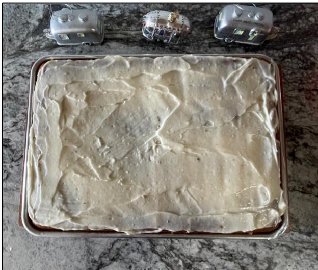
We tried out the recipe in the OAC Newsletter Test Kitchen. The verdict: delicious!