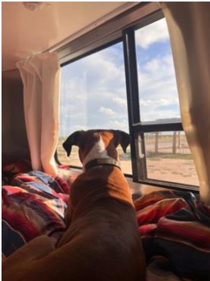
Maggie pondering life from the Bambi's bunk at Galveston Island State Park

Life on the road has allowed me to spend more time with family and friends across Texas and the U.S. My four-legged companion (who doubles as the company mascot), Maggie, joins me on all adventures, and she has come to appreciate the comforts of Stella. While a technology professional, I have developed a method to allow for constant connection to the internet so I can maintain all responsibilities with the goal of exploring all corners possible in North America. Maggie and I are working to familiarize ourselves with our rig and work cadence by visiting Texas State Parks and then setting out on a trip north to Maine and then across Canada. You can find me hiking or biking various trails on the road, sampling local food and wine, or relaxing at camp. When not on the road, our home is in the Heights-Houston area, and "Stella Sapientiae," a Beneteau sailboat, is currently berthed in the Clear Lake Shores area where Maggie and I explore its coastal waters.