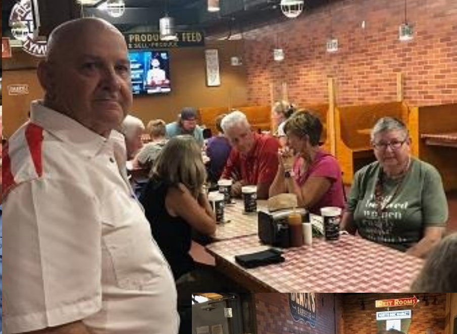
Pictures from the THCU August 2022 Luncheon @ Black's BBQ in Lockhart, TX