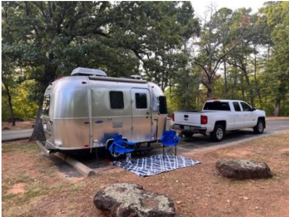
Tyler State Park, Site 11

I'm the proud owner of "Stella Intellectus," a 2018 Bambi acquired in June. The Bambi has been the ideal size for us as a home-away-from-home, allowing for nimble navigation in urban areas and quick setup/break down at camp.