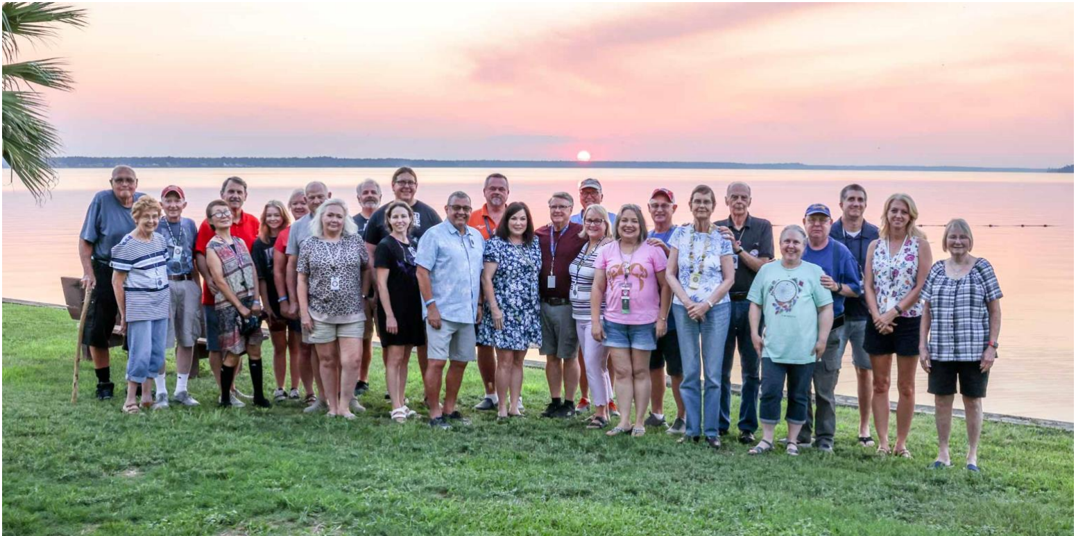
Good looking group on Lake Livingston