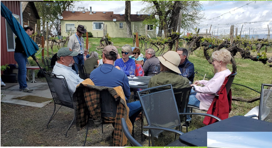
Winery Tour Prosser, WA