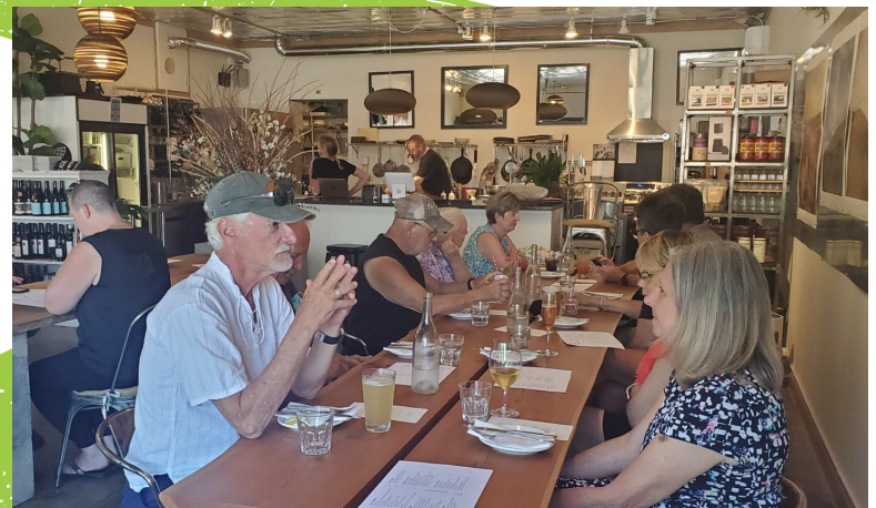
Dinner in Tieton and an amazing fire pit -Elk Ridge Rally