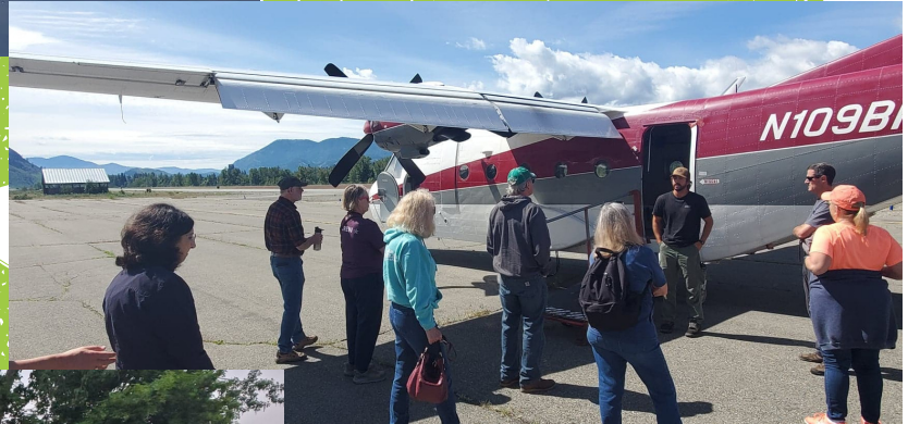
Tour of smokejumpers base, Winthrop, WA