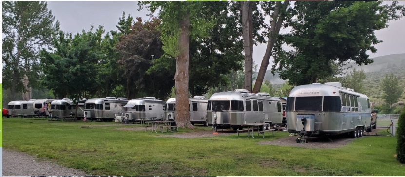
Riverbend Rally, Twisp, WA