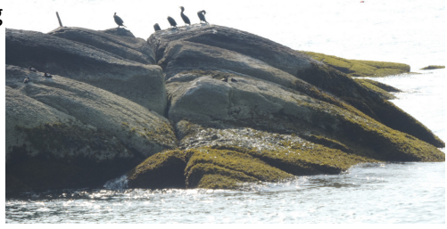
(Continued on page 7)

around Easter Egg Island, where a puffin colony had been reestablished about 25 years ago, after all the