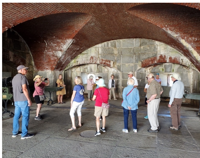
The architecture elements provide the atmosphere of quite reflection as we imagine what it must have been like to be there when the huge cannons were live and ready for action