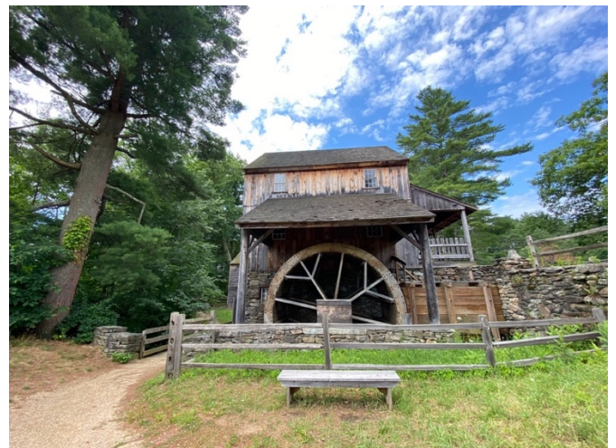
A few different mills were visible. Wood, Cotton, different machinery was used and explanations and drawings on the signs were fascinating