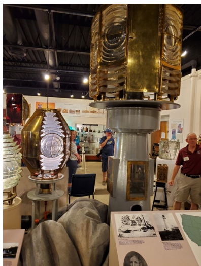
Maine Lighthouse Museum