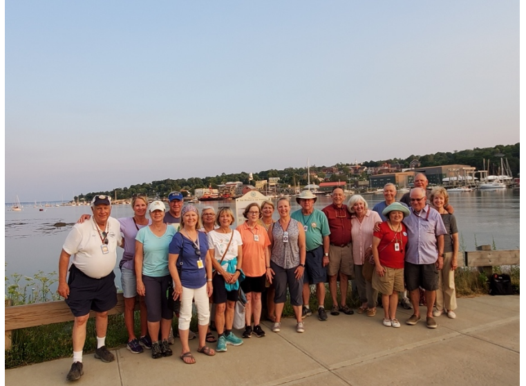
Impromptu Group Picture: Belfast Harbor near the pedestrian bridge circa Day 8....