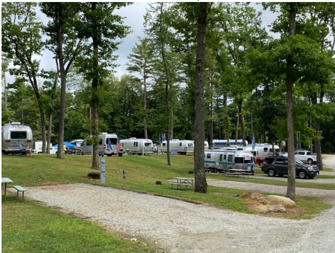
Pine Lake RV Resort has lots of space and amenities and everything looked new and fresh