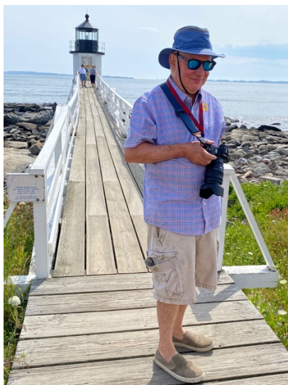
Marshall Point Lighthouse

Day 5 continued: Port Clyde and back to Searsport for dinner and group photo and night cap