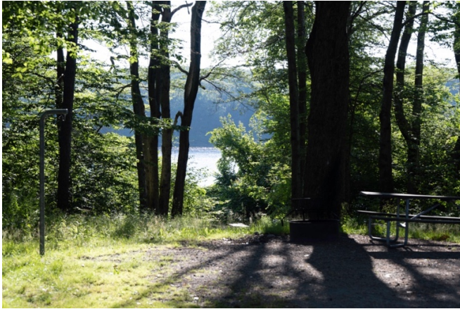
View of the lake as we depart the Poconos