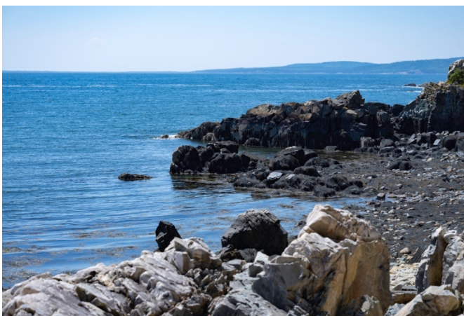
Acadia National Park