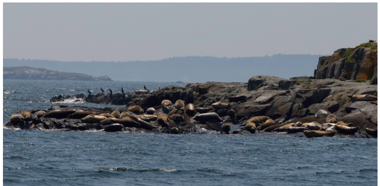
The seals sunning themselves on the rocks as we sailed by. I count at least 19 seals in this one picture