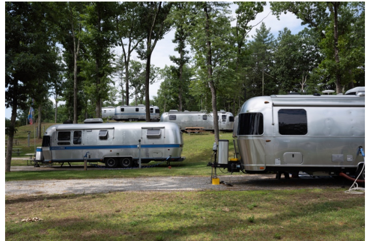
Arrive in Sturbridge, Silver everywhere