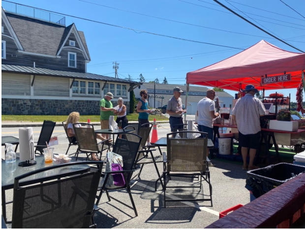
Winter Harbor “Hot dog stand” The owner of this restaurant experiencing labor shortage so he opened a lobster roll stand that he and his wife can manage on their own