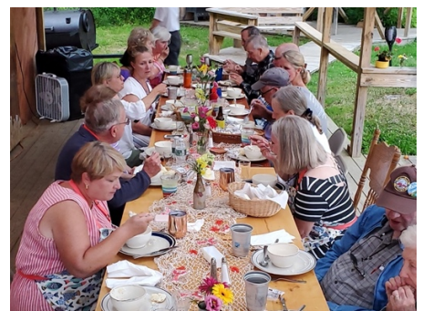
Fish soup and 6 types of Pie

Thank you for joining us on our 2022 NORVA Caravan to Maine We will see you down the road –