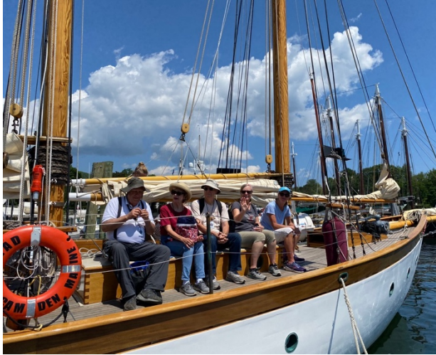
All aboard our four-hour tour