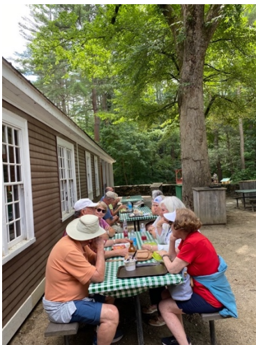
Lunch at the Tavern, the hot pot pies were unusual, short wide and round, yum!