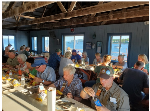
We all sat upstairs, beautiful views from the windows, gorgeous day in Belfast