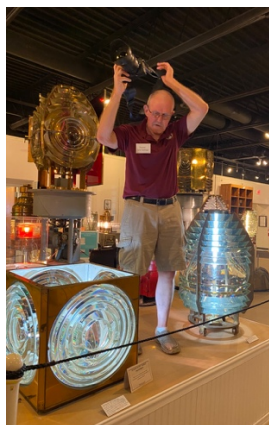
Our cool guide climbed up on the exhibits to get our group photo