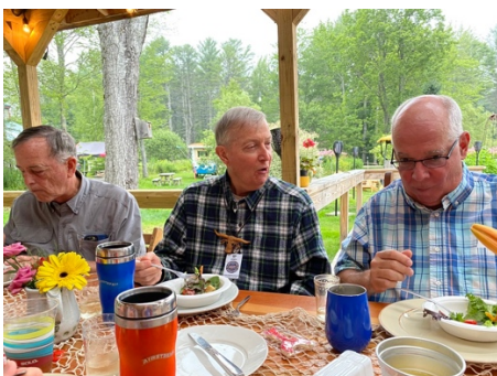
Husbands of the Ladies who are in the Banquet Choir