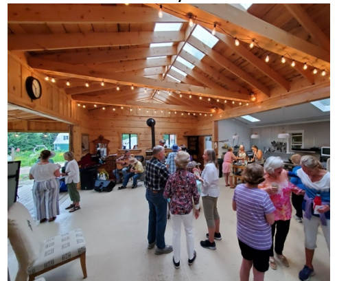
What a great banquet night, we have a band!