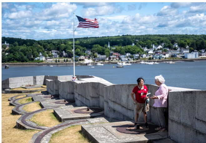
Over the ramparts our flag proudly wave