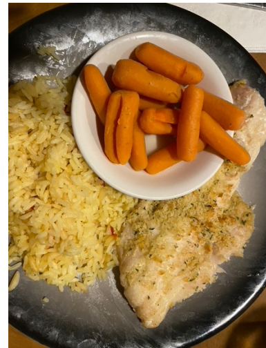
Haddock at Teddy G's, caravan members also affectionately referred to this restaurant as Kenny G