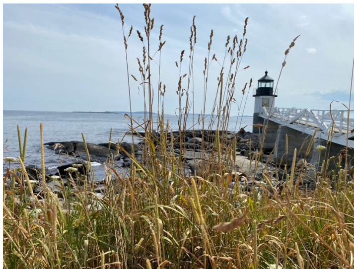
Lighthouse and Museum at Port Clyde, St George Peninsula