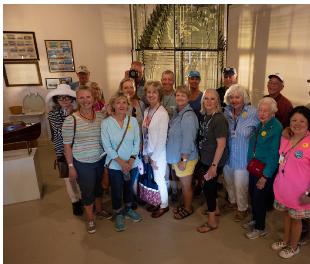
Private Tour at the Maine Lighthouse Museum