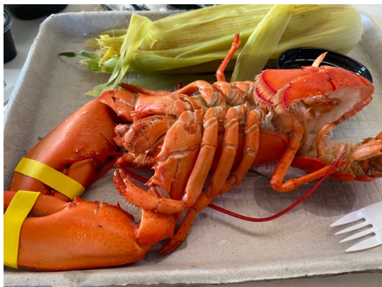
Dinner was delicious!! Lobster, corn on the cob, coleslaw, butter