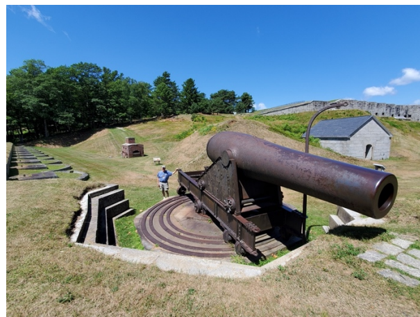
Ok it is time to bring out the big guns