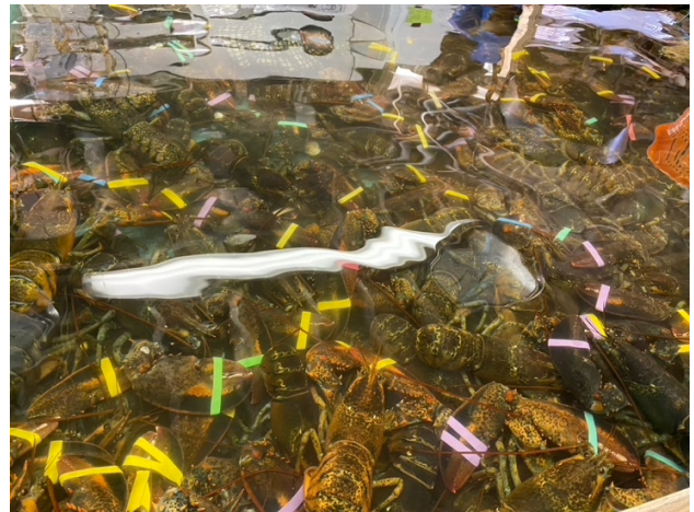
DA LOBSTAHS at Young's Pound in Belfast Maine. Apparently, all this time I have been pronouncing these Maine lobster's incorrectly