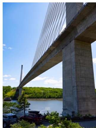
The famous bridge spanning the Narrows