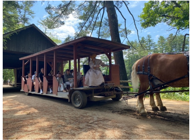
All aboard and under the Covered Bridge.

This village setting was very much like Williamsburg in concept but lower key and relaxed. The young children dressed for the part, playing in the field was a nice touch and there was a filming team focusing on men harvesting hay in the field.