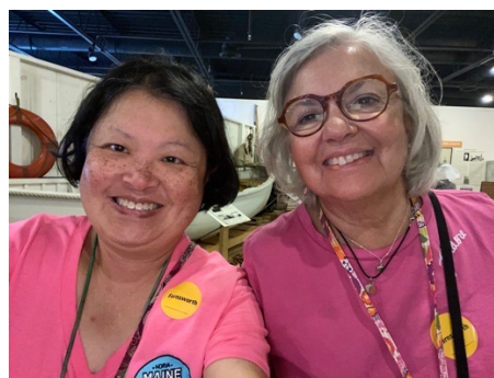
Twining in Pink