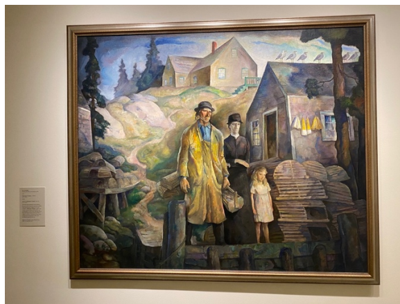
Fisherman's Family By N.C. Wyeth