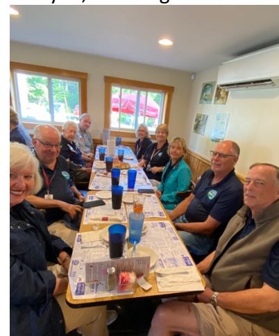
Anglers Restaurant in Searsport - The tables were placed as shown in the pictures