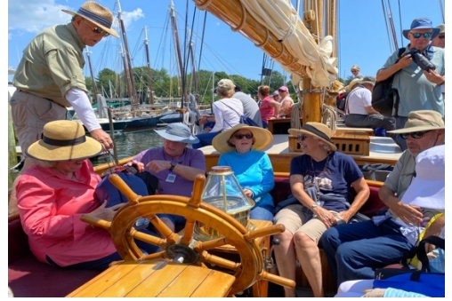
Is everyone comfy?