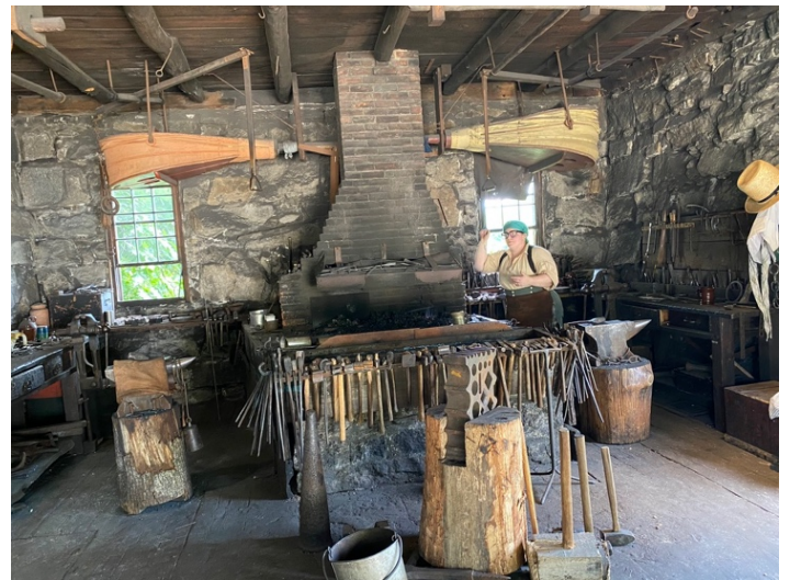
Fascinating Iron work.