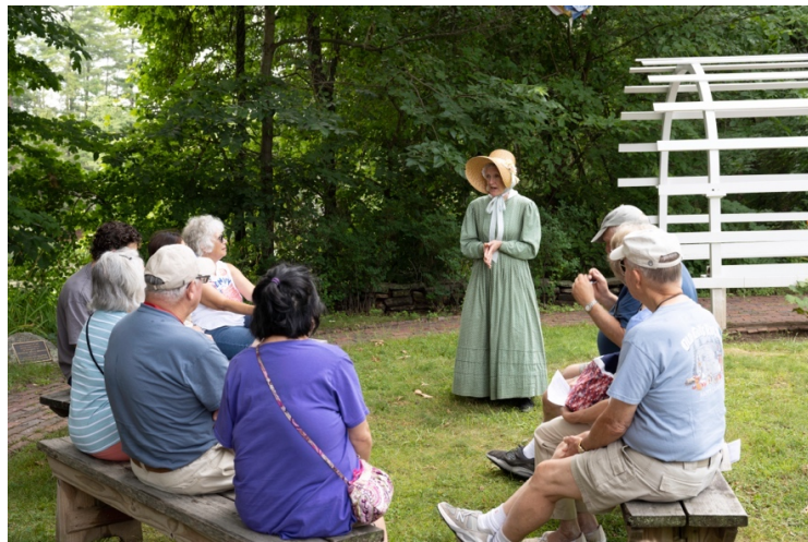
The midwife describes childbearing in those days. Dangerous for mother and child.