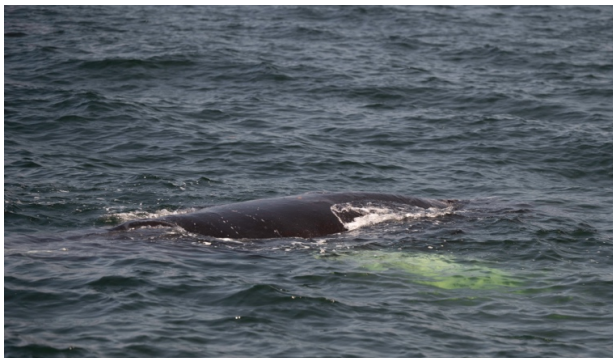
The Minke whale does not usually come to such shallow waters where Schooner Olad traversed, a rare sighting indeed. The light green in the picture is the belly of the whale reflected in the light. The nose of the whale is in the extreme right of the picture