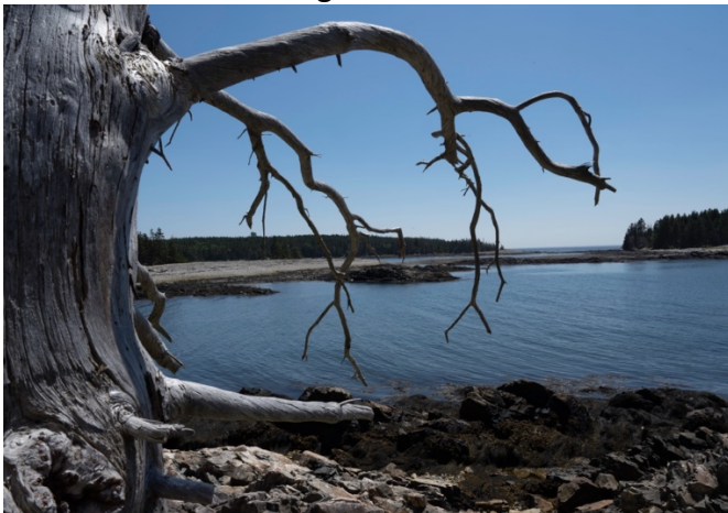
Schoodic Point Area