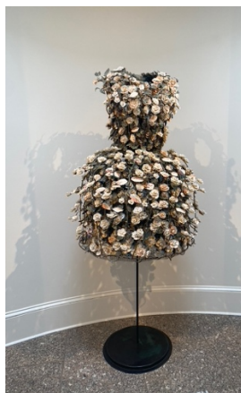
Dressy: Copper tubing and shell by Brian White