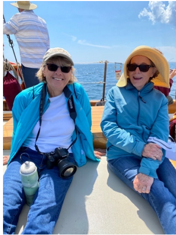
Twining in blue and gold, what a glorious day