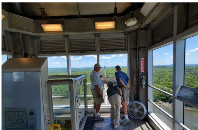
The observatory - stunning 360 views