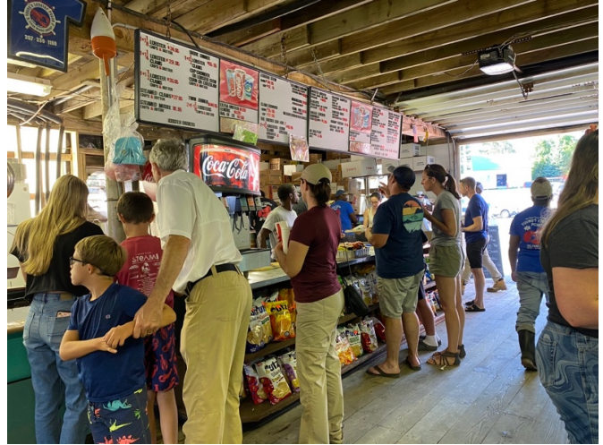
Young's Lobster Pound. This picture was taken just before the crowds started arriving for dinner