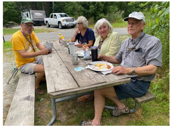
Day 1: Tuesday, July 12, 2022: Promised Land State Park, Greentown (Pocono Mountains), Pennsylvania