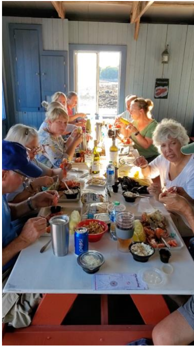
An awesome dinner at Young's Lobster Pound.