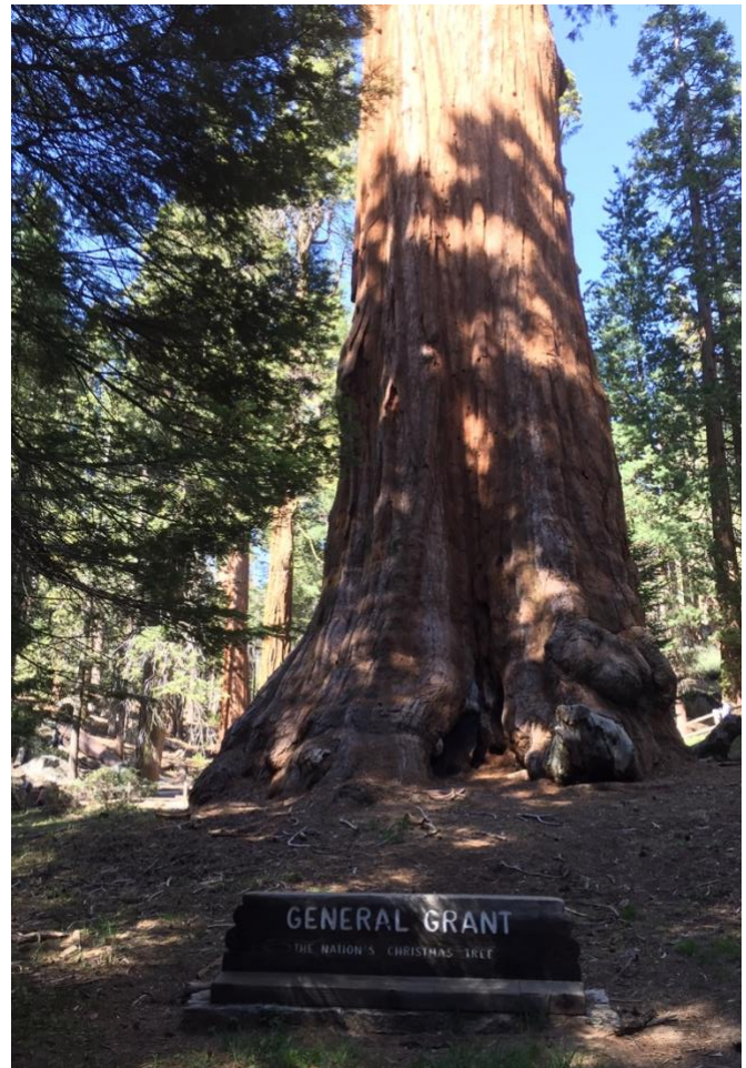
General Grant Sequoia in Kings Canyon