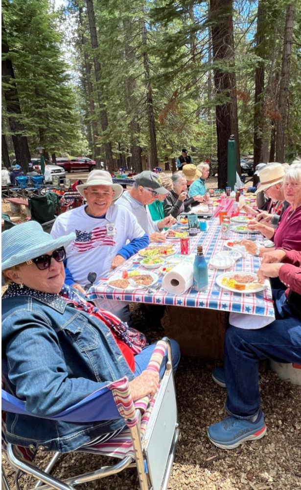
Lake Tahoe Memorial Day Picnic