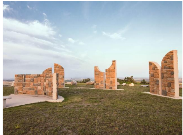
Mystical Horizons – ND Stonehedge