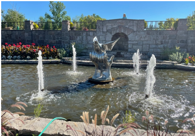
Promise of Peace