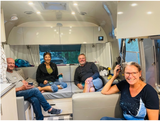
A fun night of visiting