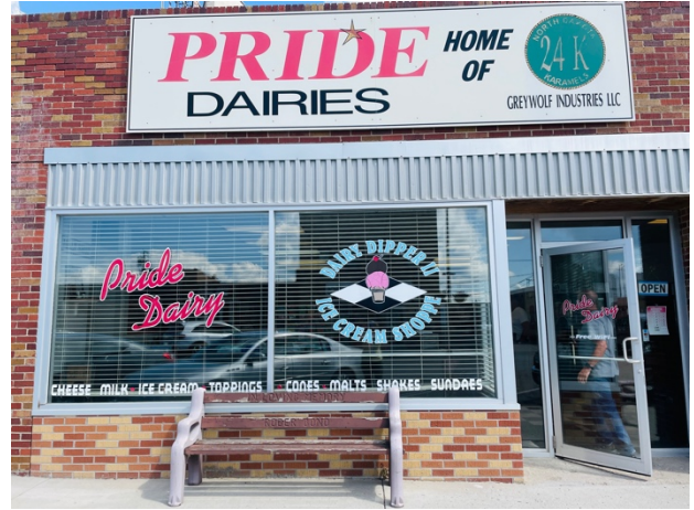
Ice Cream, Ice Cream, Who Screams for Ice Cream?