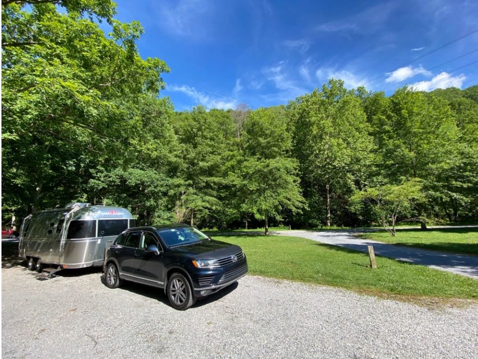
$47.12 – Hungry Mother State Park (Marion, VA)

The cost for diesel, one-way, was $725. The average cost of Diesel was $5.30 and ranged from $5.10 to $5.61 per gallon. I just filled up today (August 9) in Santa Fe for $4.53/gal. My trip home should cost much less. And here's where I stayed enroute.