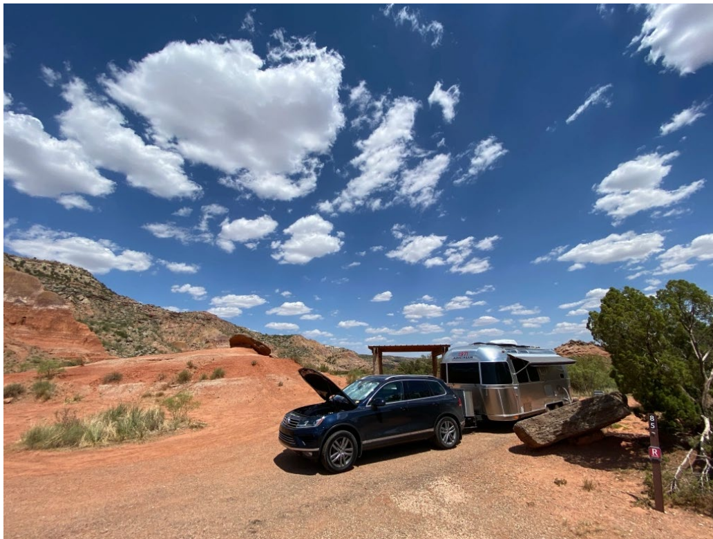
$34 – Palo Duro Canyon State Park (TX) If you can get a spot here when you pass through Amarillo, Texas – DO IT.