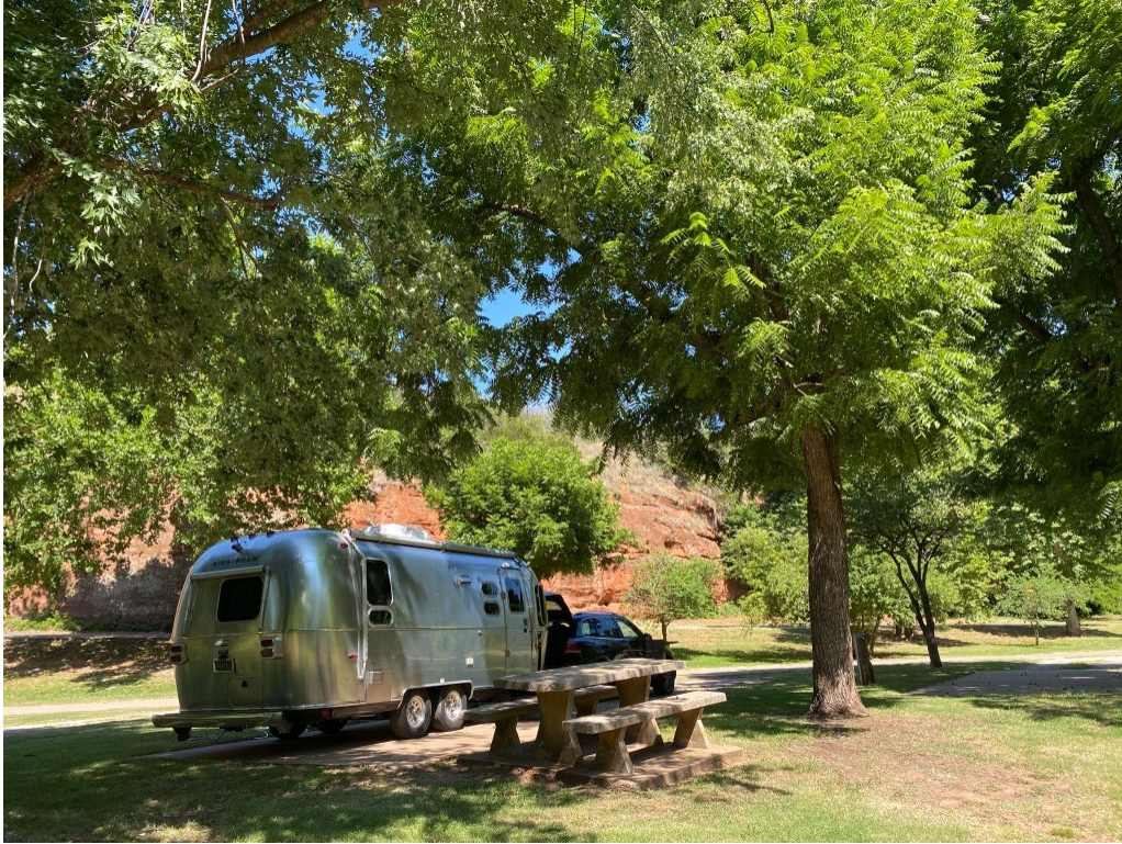
$30 – Red Rock Canyon Adventure Park (Hinton, OK) One of my favorite and unexpectedly beautiful campgrounds near Route 66 in Oklahoma.