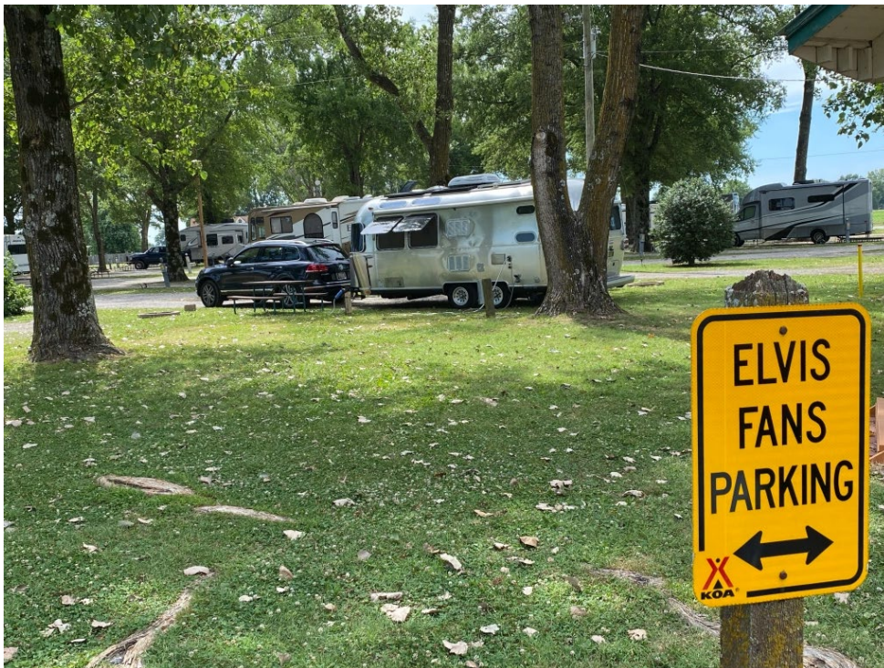
$56.64 – Memphis KOA Journey (Marion, AR) Kinda pricey for what it was, but they had a nice pool...