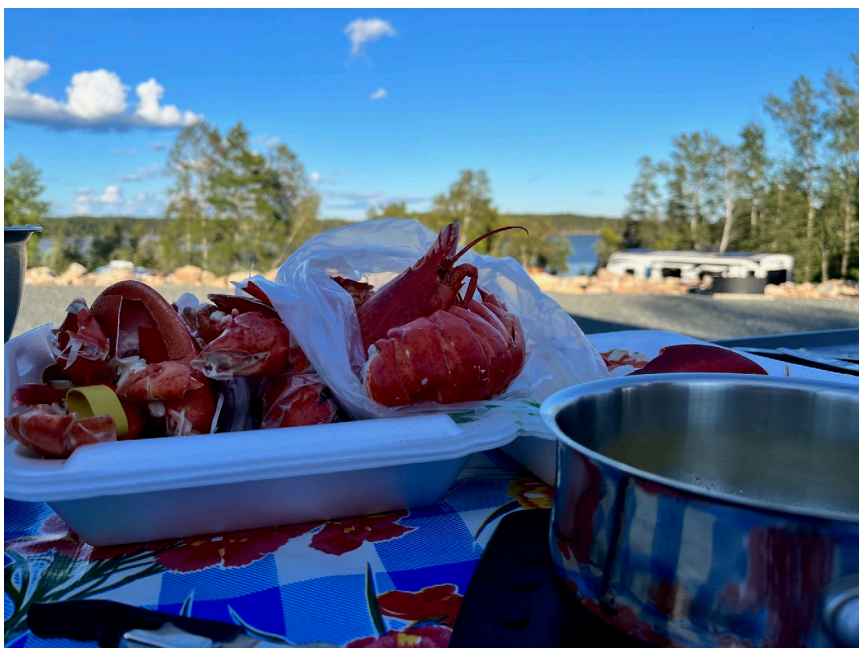
Did you attend the International Rally in Fryeburg, ME?

WBBCI: Wally Byam Caravan Club International Inc.