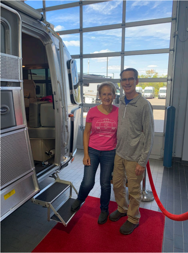
Photo at Colonial Airstream