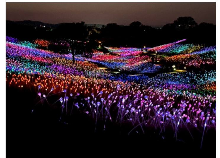
Parts of Sensorio - befpre & after nightfall

On Saturday, everyone again dispersed, with some going to the Coast yet again, and others going out to meals at local restaurants.