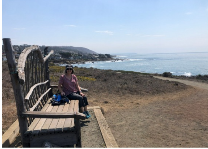
Cambria - Moonstone Beach