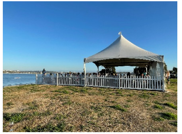
The entry parking process took most of Thursday afternoon, and left everyone with plenty of time to visit with others and enjoy the balmy afternoon,

On Thursday, September 15, roughly 60 Airstreams parked in our separate area around and near the lakeshore, the solar-only rigs getting the best spots right on the bay shoreline, some with an unimpeded view of the bay and north end of the race course for the largest thunder boats. Those of us with generators were somewhat farther away, but we all had access to the entire Crown Point area and could walk along the beaches. A large party tent was erected on a grassy knoll in the Airstream Area that provided shade and a wonderful viewing area whenever anyone wanted to watch a boat race or two.