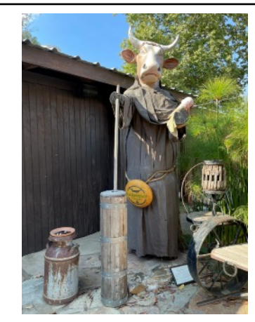
Some of the different cows of Harmony the town owner has collected.