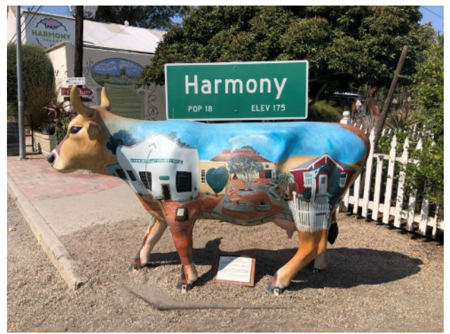
Gracie the Harmony Cow

Founded in 1869 around a burgeoning local dairy industry, Harmony served as the home of the Harmony Valley Creamery Association and de facto capital of Central Coast dairy production for nearly half a century, while also serving as a picturesque pit-stop for the rich-and-famous on their way to visit William Randolph Hearst just up the road. The Creamery eventually closed, but the town survived, now home to a glassworks, pottery shop, food truck, funky sculptures, a wedding venue a VRBO cottage, and on the weekends, an ice cream truck.