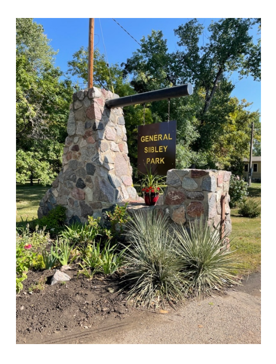
General Sibley Park & Campground

We arrived at General Sibley Park and Campground about 2:00 p.m. and as we ventured to our campsite, we saw shiny silver in the distance. Yes, fellow ND Peace Garden Unit members had already arrived. We had a very good turnout for the rally with 12 units showing up.