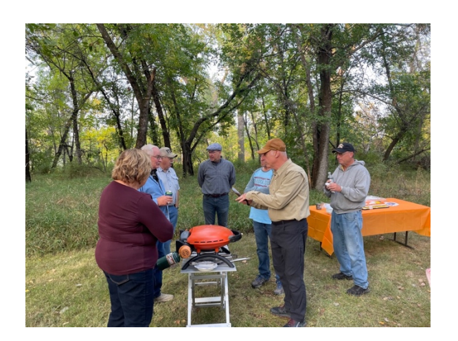
Cooking and Conversation – A good Combination