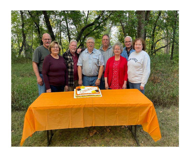
North Dakota Peace Garden Unit's New Board