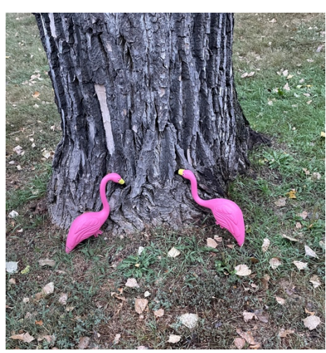
Poor little guys - Oops - we forgot their legs!