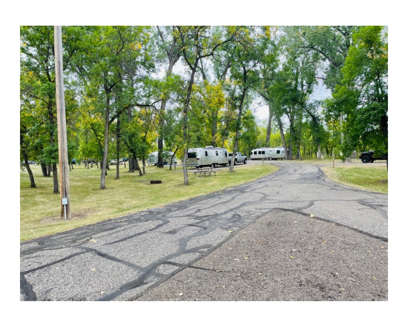
Shiny Silver awaits us