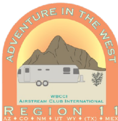
Region 11 Logo