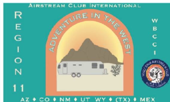
Region 11 Flag