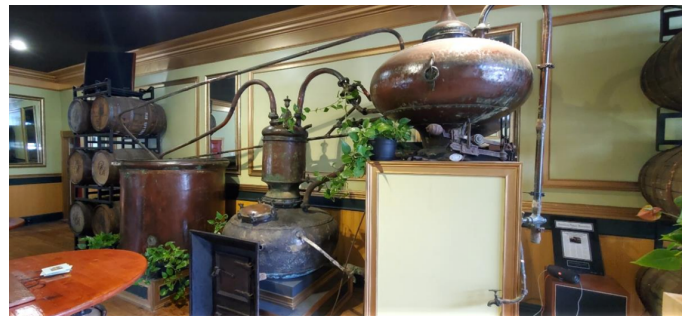
Antique 18th century cognac still from France