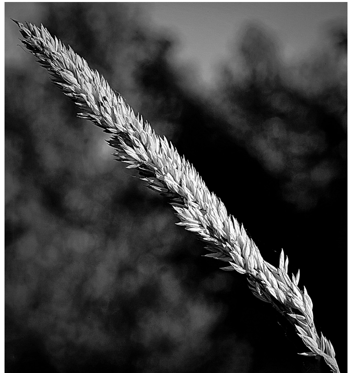
Below: Actual prairie grass