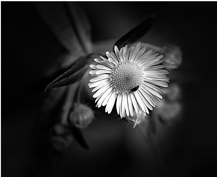
Above: flower portrait

We are heading to a state park in Iowa and then to a few days in Lincoln, Nebraska. We will visit the University of Nebraska’s International Quilt Museum—one of the largest and most comprehensive quilt collections from America’s early founding to early twentieth-century works. But first, up the Rockies, a quick stop in Vail, Colorado and then coasting on the “engine break” into the mid-west. More to report, including the reason for our Boston detour. In the meantime, stay safe out there.