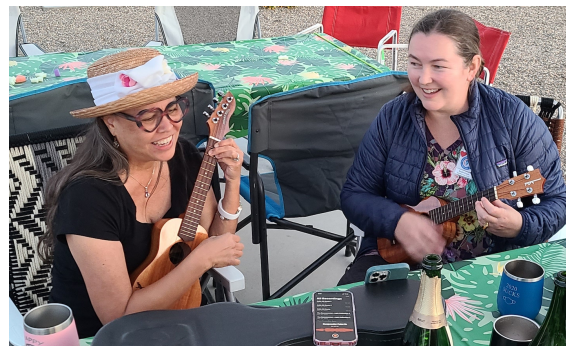
Above: The hula line up. Left: Lovely sites. Above: Ukulele sisters