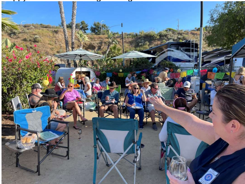
Happy hour and admiring the keg trailer