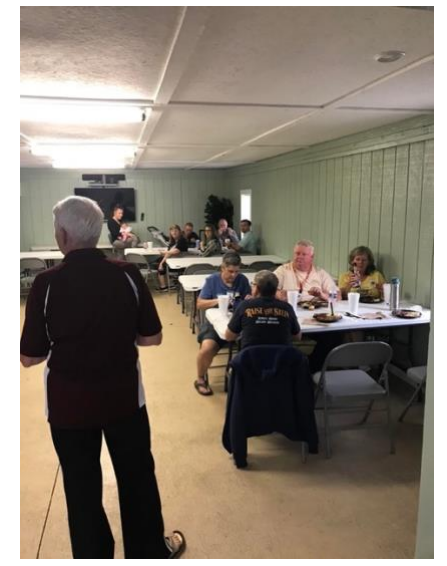
and a great time was had by all.

a potential problem. The river did rise to the first street, but no further.