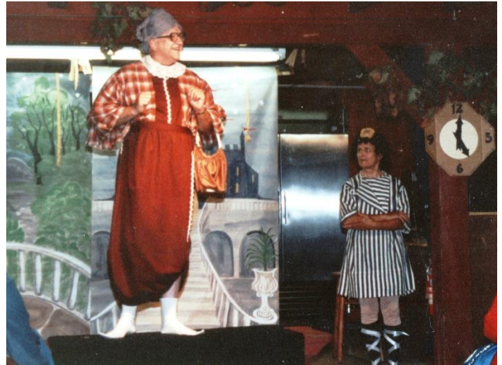
Mrs. Charming modeling her costume with the Royal Page standing ready to serve.

And now a new summer season of rallies begins, along with a new season of memories to be made. Have a great summer!