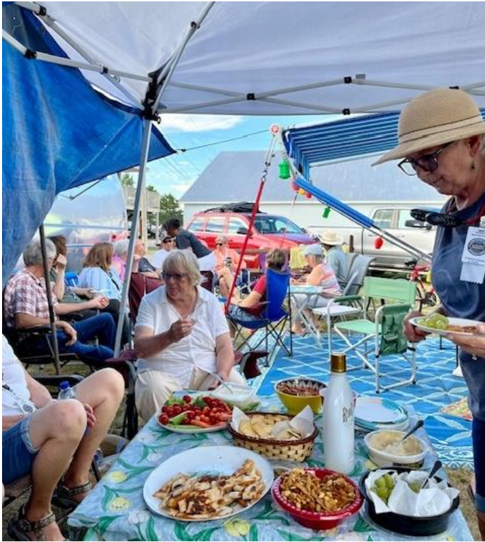
PAC Happy Hour at Fryeburg