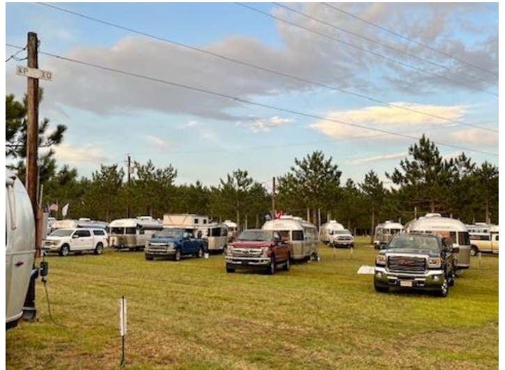
Parking at Fryeburg - 920 trailers

International Rally photos from Bill Woodford: