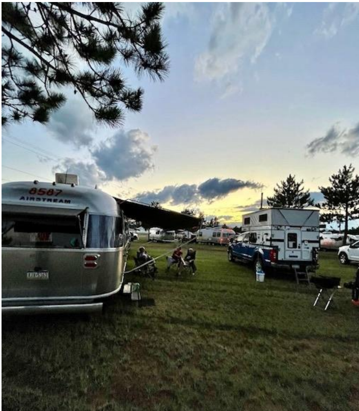
Evening with Friends