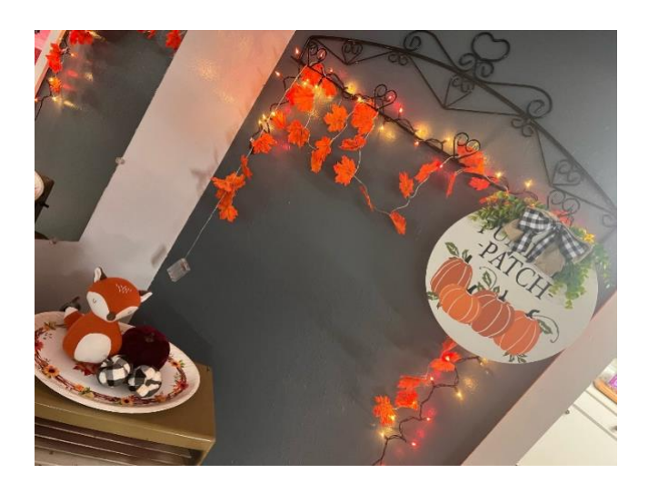
Welcome to the Harvest Rally