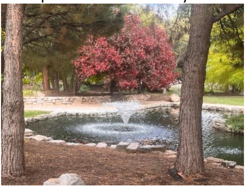
Gage Gardens in Marathon, TX