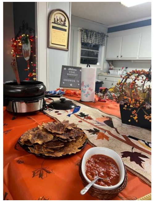
Happy Hour Appetizers