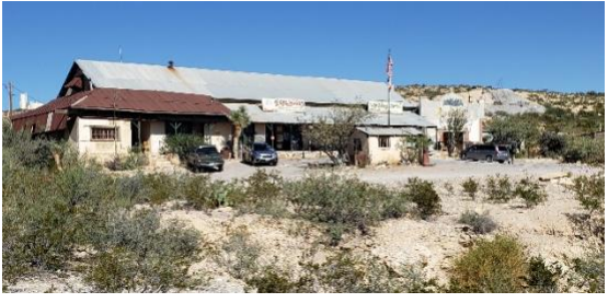
Terlingua Ghost Town, Starlight Theater is on far right