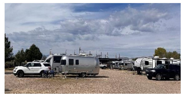
Marathon Motel and RV Park