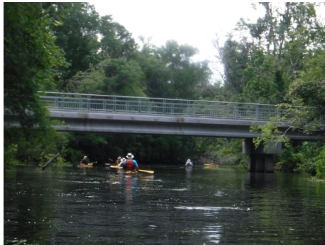
Deep Creek under Palatka-St. Aug. rails-to-trails bike path

The St. Johns County Fairgrounds are located about 5 miles west of St Augustine with easy access to the city (address is 5840 SR 207, Elkton, FL). The fairgrounds offer water and 30-amp electric at each site. (We will have a few 50-amp sites for those who may need it.) There is a dump station on site as well as showers and restrooms. We have arranged to have the club house, which offers lots of seating, air conditioning and restrooms, for