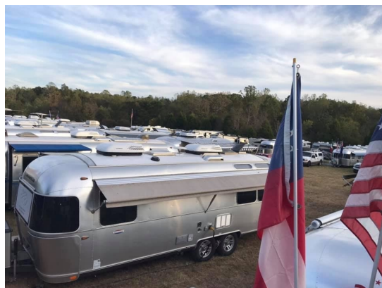
Trailer photo by Beth Hackney

Missy and Al Waschka #1322 awaschka@bellsouth.net